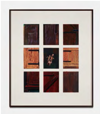
BENDT EYCKERMANS Portable strongbox , 2021

Oil on paper 56 1/2 x 48 3/8 x 2 inches (143.5 x 123 x 5 cm.) framed (BEE22-015)