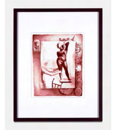
BENDT EYCKERMANS A fateful encounter , 2022

Ink on paper 9 1/8 x 7 1/8 inches (23 x 18 cm.); 13 x 10 1/4 inches (33 x 26 cm.) framed (BEE22-017)