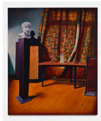
BENDT EYCKERMANS The successor , 2021

Oil on linen 73 5/8 x 57 1/2 inches (187 x 146 cm.) (BEE22-001)