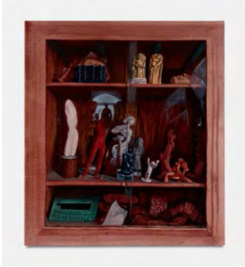
BENDT EYCKERMANS Archive and memory , 2022

Oil and ink on linen 29 1/4 x 26 inches (74.2 x 66 cm.) (BEE22-002)