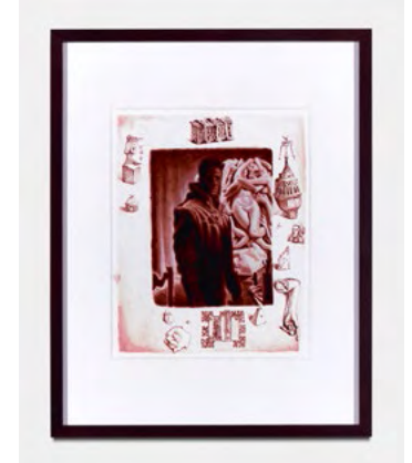
BENDT EYCKERMANS Ancestral inquiries , 2022

Oil and ink on linen 23 1/4 x 19 3/4 inches (59 x 50 cm.) (BEE22-004)