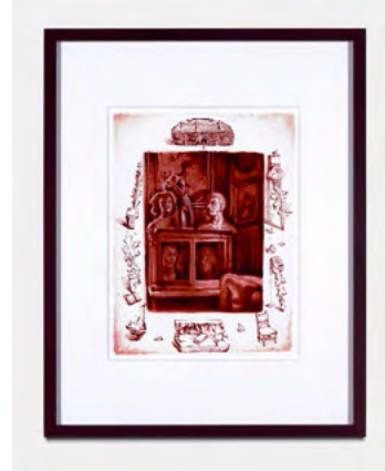
BENDT EYCKERMANS A collection of heads , 2022

Oil and ink on linen 75 1/4 x 70 1/2 inches (191 x 179 cm.) (BEE22-007)