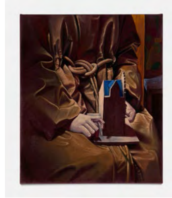
BENDT EYCKERMANS Rain-drenched autumn palace , 2022

Oil and ink on linen 83 1/2 x 69 1/4 inches (212 x 176 cm.) (BEE22-013)