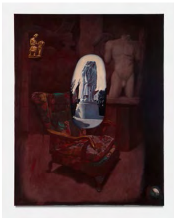
BENDT EYCKERMANS Mnemonic palace , 2022

Ink on paper 9 1/8 x 7 1/8 inches (23 x 18 cm.); 13 x 10 1/4 inches (33 x 26 cm.) framed (BEE22-019)