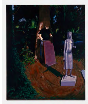
BENDT EYCKERMANS The wounded man , 2021

Oil and ink on linen 29 1/4 x 26 inches (74.2 x 66 cm.) (BEE22-002)