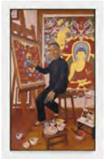
Patrizio di Massimo Lok Chitrakar, 2022 Oil on linen 223.5 x 133 cm (framed) 88 x 52 3/8 in (PDMa015)