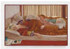
Patrizio di Massimo As Snug as a Bug in a Rug (Francesca, Filippo and Martino), 2022 Oil on linen 134 x 204 cm (framed) 52 3/4 x 80 1/4 in (PDMa014)