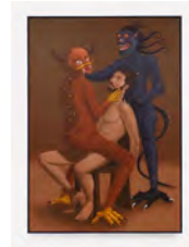
Patrizio di Massimo Untitled (Monsters), 2021 Oil on linen 204 x 144 cm (framed) 80 1/4 x 56 3/4 in (PDMa011)