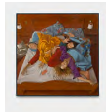
Patrizio di Massimo As Snug as a Bug in a Rug (Francesca, Ale e Giuilo), 2022 Oil on linen 185 x 185 x 5 cm 72 7/8 x 72 7/8 x 2 in (PDMa010)