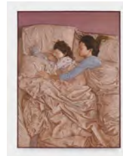
Patrizio di Massimo Diana and Nicoletta (28B Erlanger Road), 2022 Oil on linen 234 x 174 cm (framed) 92 1/8 x 68 1/2 in (PDMa013)