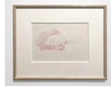
Patrizio di Massimo Sleeping Diana, 2022 Coloured pencil on paper 21 x 29.7 cm (unframed) 8 1/4 x 11 3/4 in 36.9 x 47 cm (framed) 14 1/2 x 18 1/2 in (PDMa019)