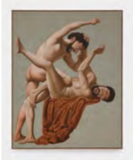
Patrizio di Massimo Self - portrait (After Lionello Spada's Cain and Abele), 2022 Oil on linen 193.5 x 154 cm (framed) 76 1/8 x 60 5/8 in (PDMa012)