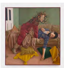
Patrizio di Massimo As Snug as a Bug in a Rug (Medusa), 2022 Oil on linen 204 x 194 cm (framed) 80 1/4 x 76 3/8 in (PDMa016)