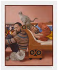
Patrizio di Massimo Than and Jordan (Penarth Centre), 2022 Oil on linen 143.5 x 114 cm (framed) 56 1/2 x 44 7/8 in (PDMa017)