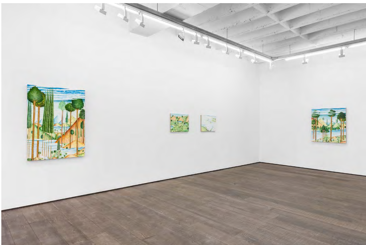
Installation view, «Sky Gardens», rodolphe janssen, Brussels, Belgium, 2022