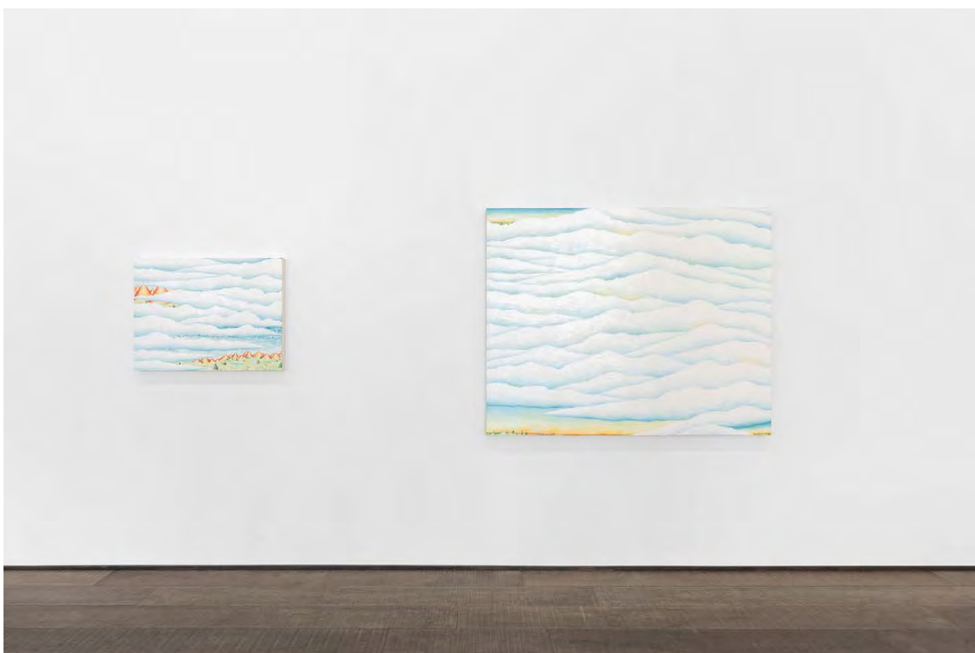
Installation view, «Sky Gardens», rodolphe janssen, Brussels, Belgium, 2022