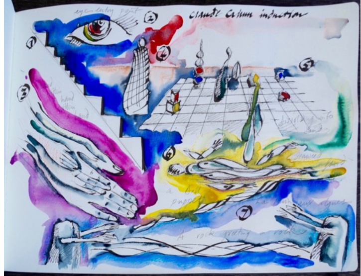
Marcos Lutyens, Cahun Induction Score , 2022, Fine Art Print on Hahnemühle Photo Rag paper 308g, 18 x 25 cm. Limited edition. Signed and numbered, sold as part of the exhibition catalogue.