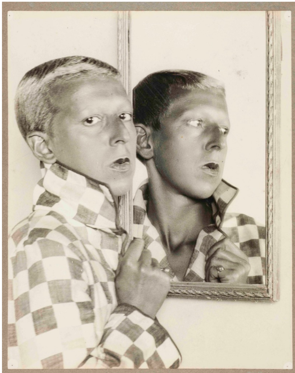
Claude Cahun, Untitled, Self-portrait , circa 1928, photograph, gelatin silver print, 30 x 23,8 cm.