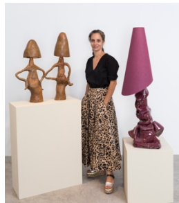
Carmen D’Apollonio [Swiss, b. 1973]