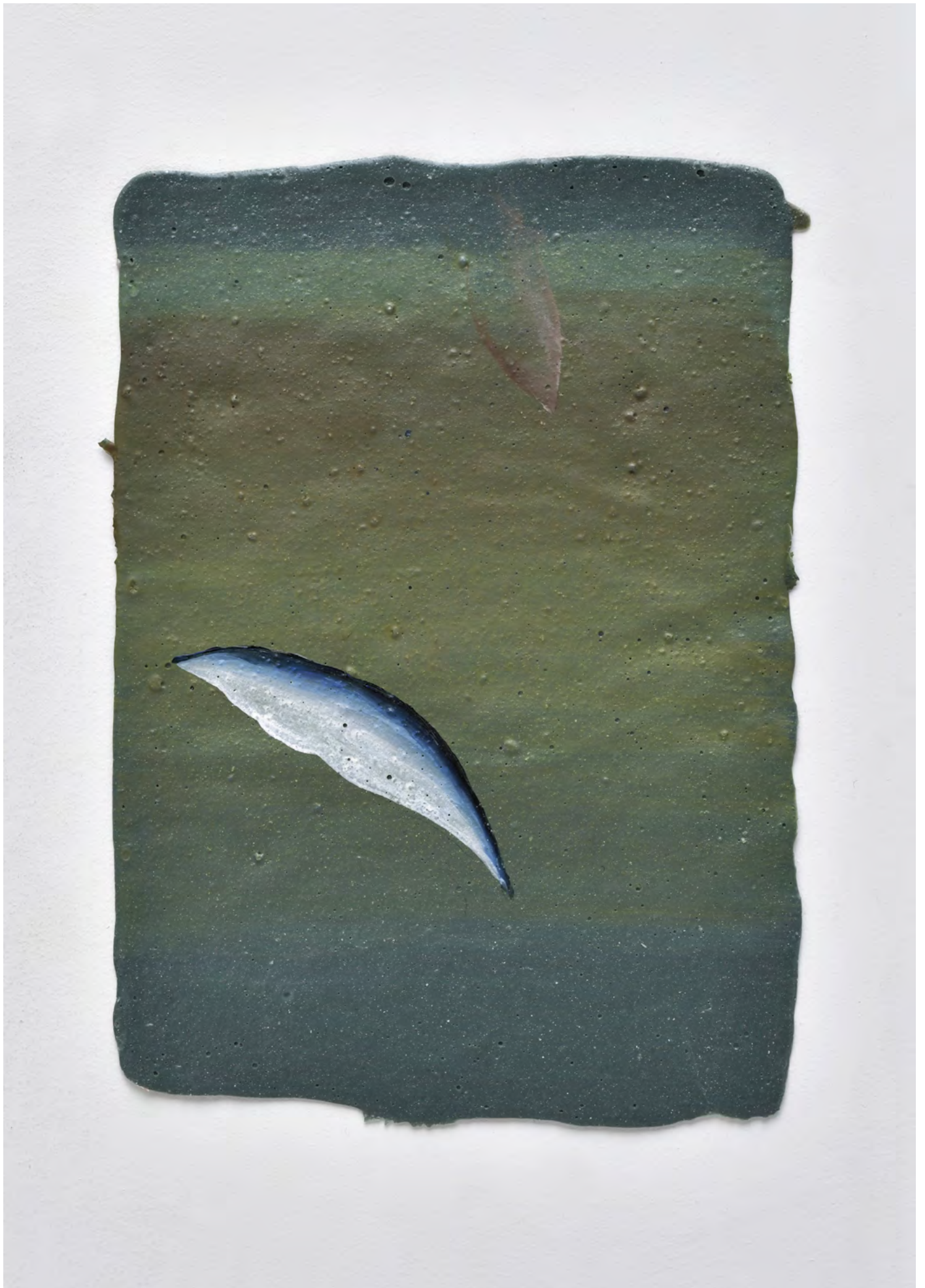
Sans titre (feuille) , 2021. Inkjet printing, acrylic binder, pigments, acrylic painting