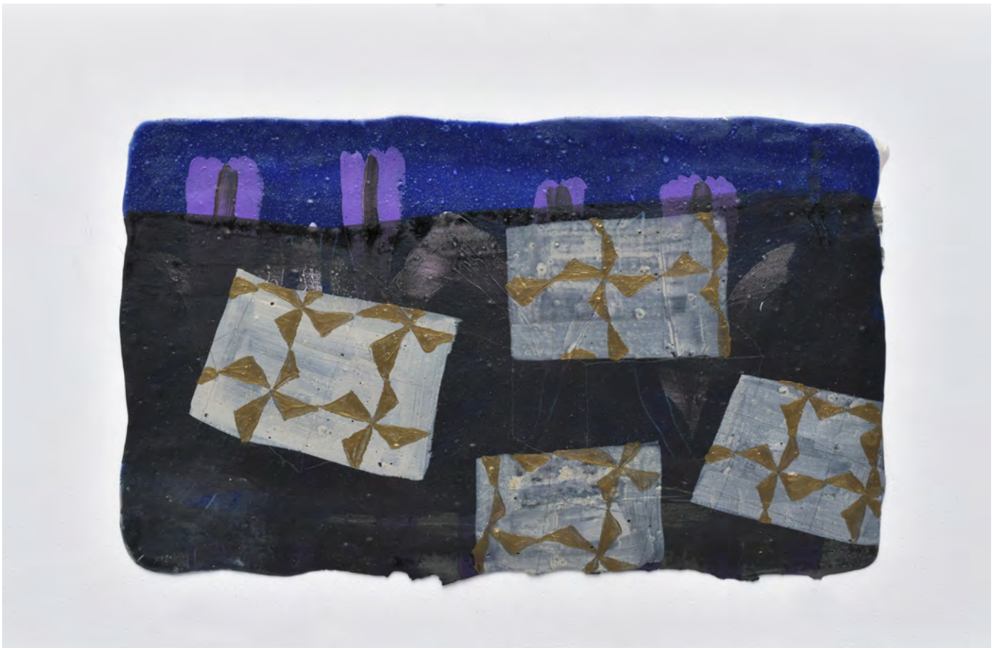
Carton bouilli , 2022. Acrylic painting, acrylic binder, pigments, pencil