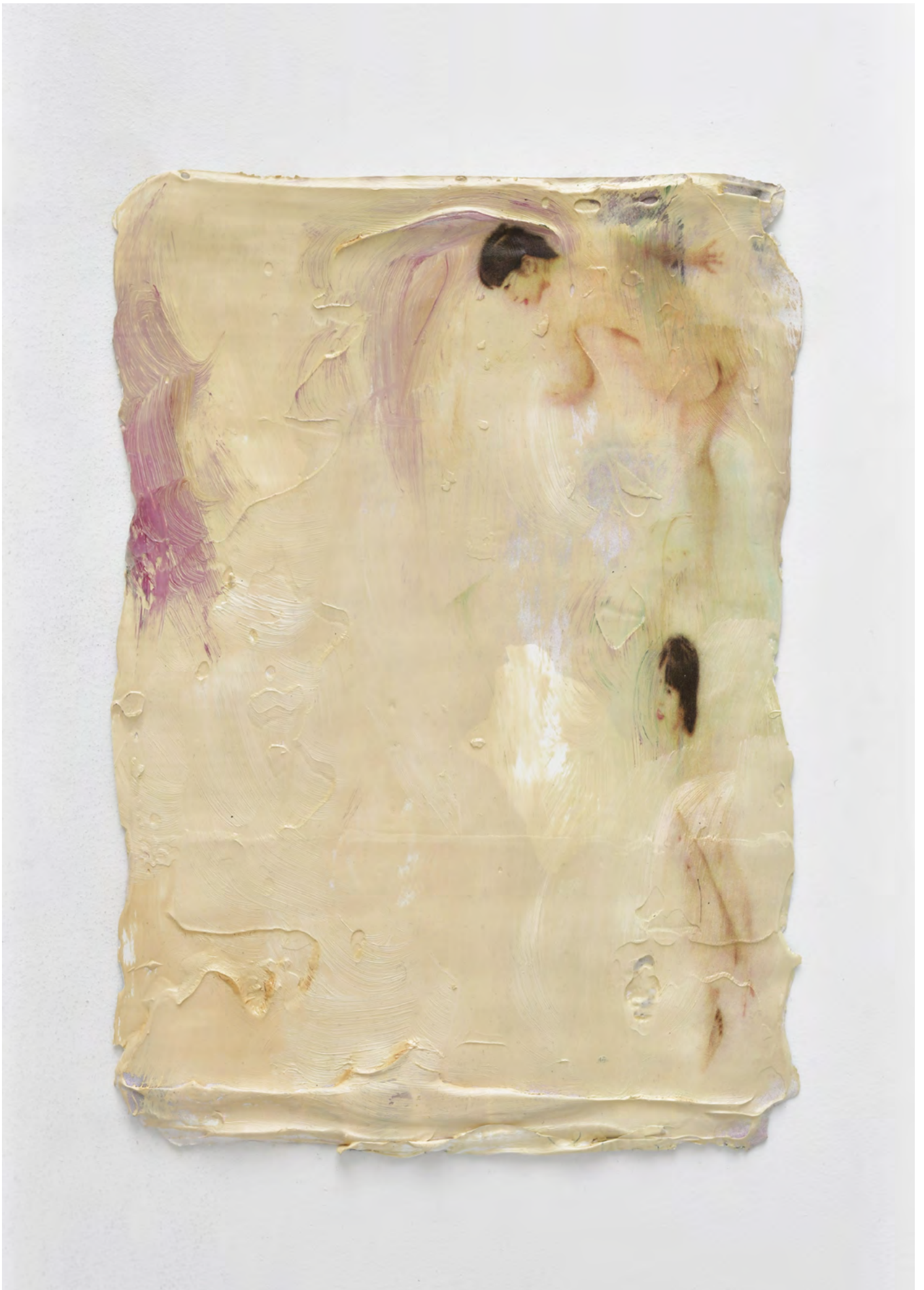
Augustes , 2021. Inkjet printing, oil, acrylic painting