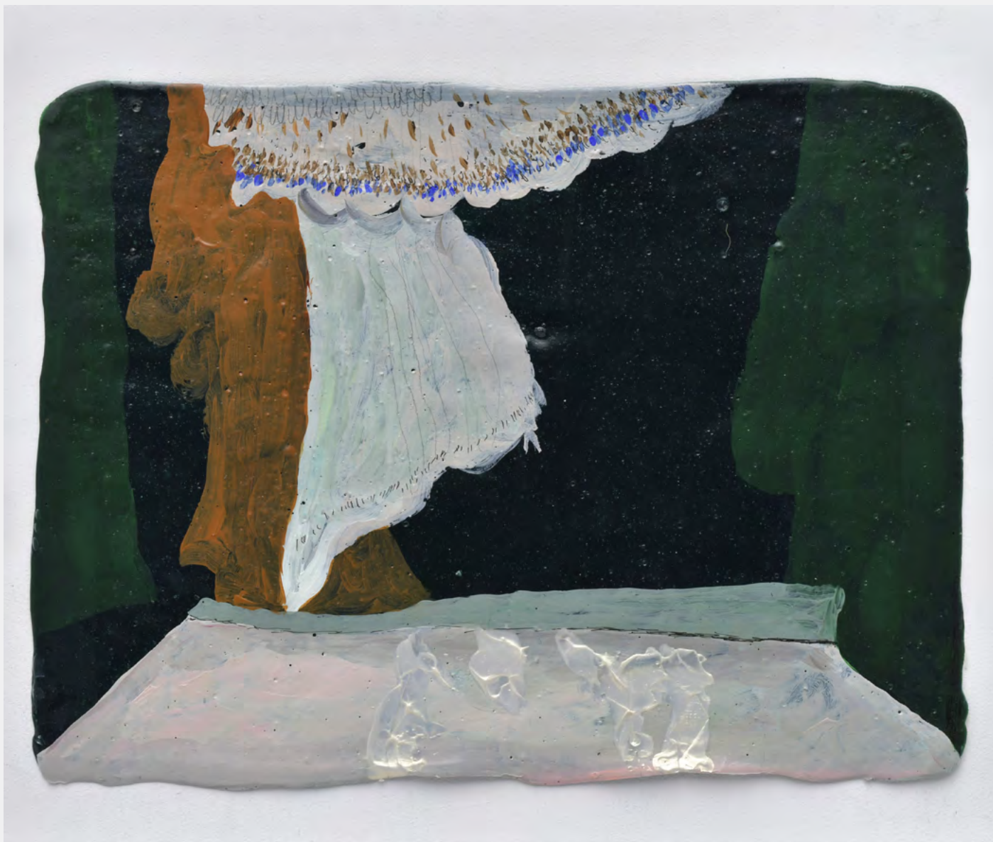
La Française , 2021. Acrylic painting, acrylic binder, pigments, pencil, ink