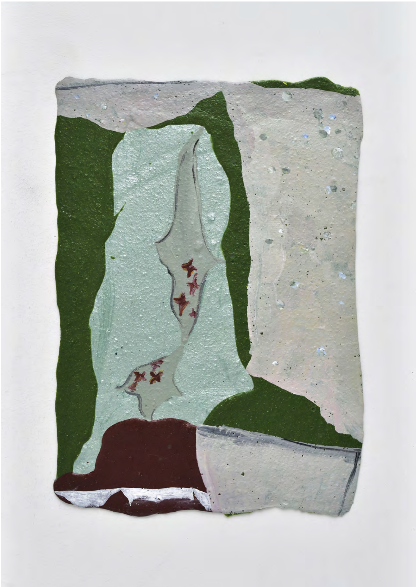
Minuit , 2021. Acrylic painting, acrylic binder, pigments