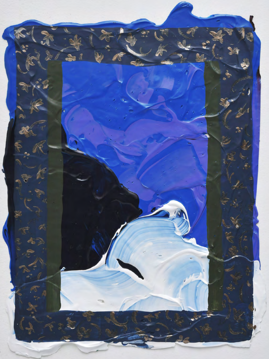
Minia , 2022. Acrylic painting