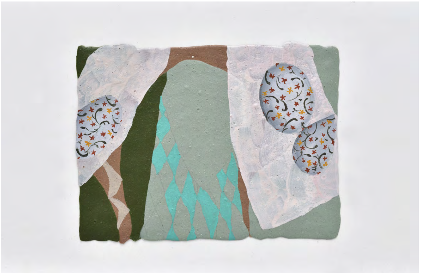
Trung, 2021. Acrylic binder, pigments, acrylic painting, pencil