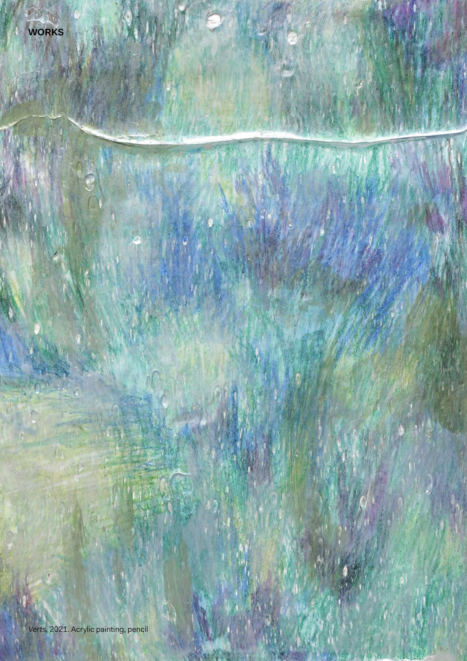
Verts, 2021. Acrylic painting, pencil