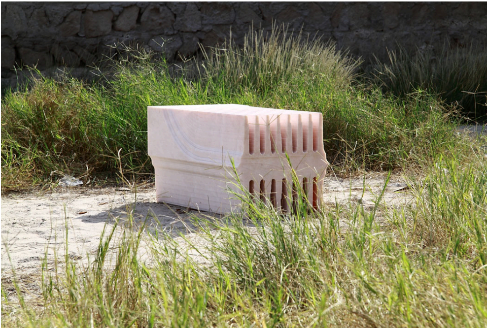
Untitled, 2011, pink marble, 34 x 69 x 34,5 cm

Trisha Donnelly is currently invited at MoMA's Artist's choice (november 2012 – april 2013), winner of the first Farber-castell prize (Neues Museum, Nuremberg). In 2013, she'll have solo shows at Serpentine gallery (London) and San Francisco Museum of Modern Art.