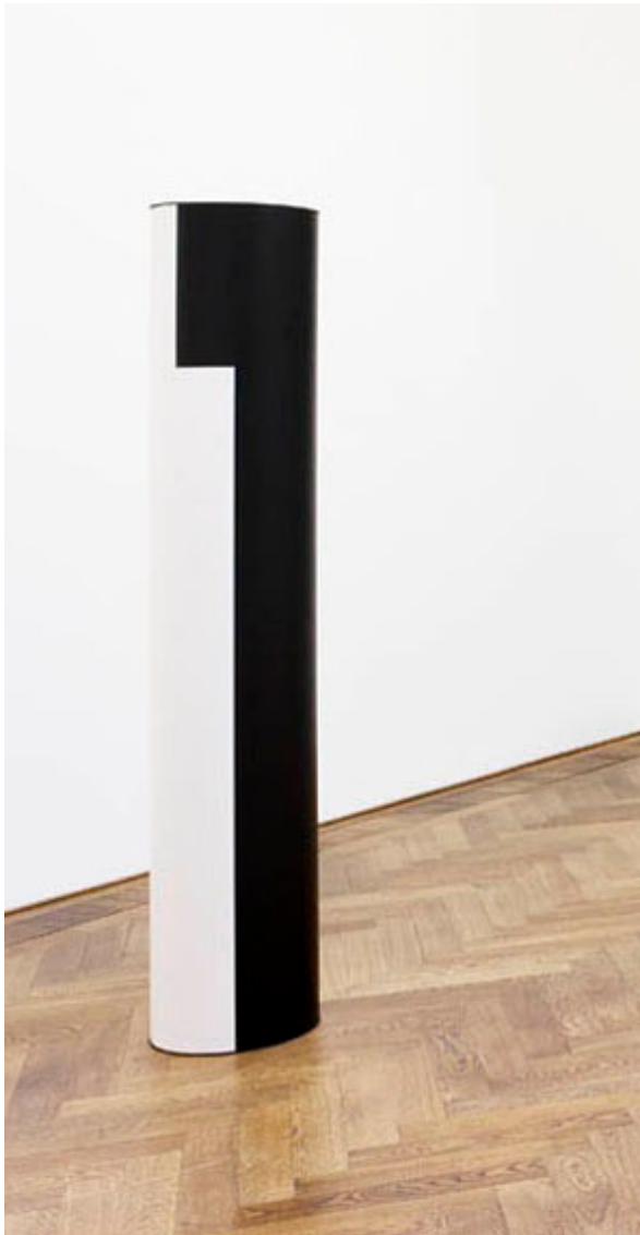
1 (one) from Numbers (Disambiguation), 2012, impression numérique sur bâche, tube, 2m, Ø 36.8 cm Vue d'exposition S.S.O.R., Kunsthalle Basel, 2012