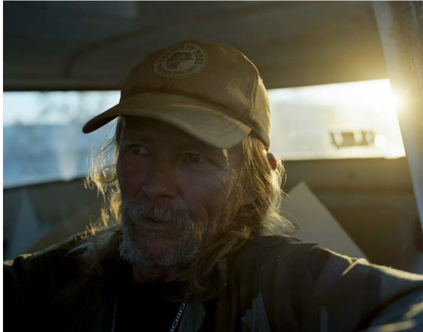
Laura Henno Jack , 2017 Silver print, 55 x 130 cm

3, rue du Cloître Saint-Merri, 75004 - Paris