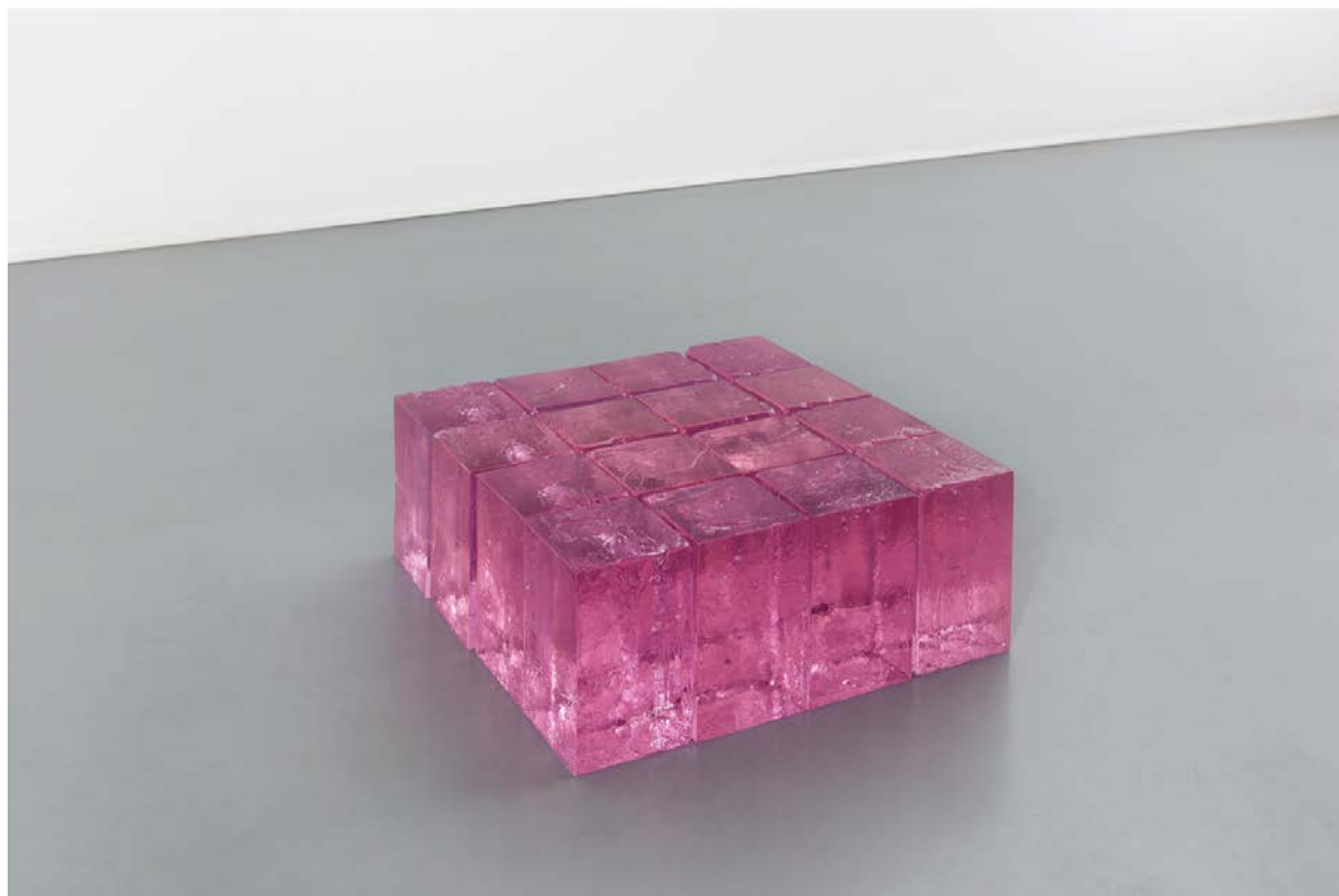
Ann Veronica Janssens 16 Pink Blocks (600), 2016 glass in 7,8 x 18,8 x 18,8; cm 20 x 48 x 48 edition of 3 and 2 AP