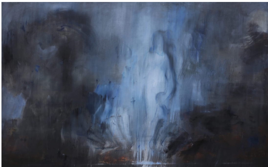
Top: Sophie Vallance, GRUMPY VENUS, 2021, Oil on canvas, 50 x 50 in, 127 x 127 cm, Copyright Sophie Vallance and PULPO GALLERY