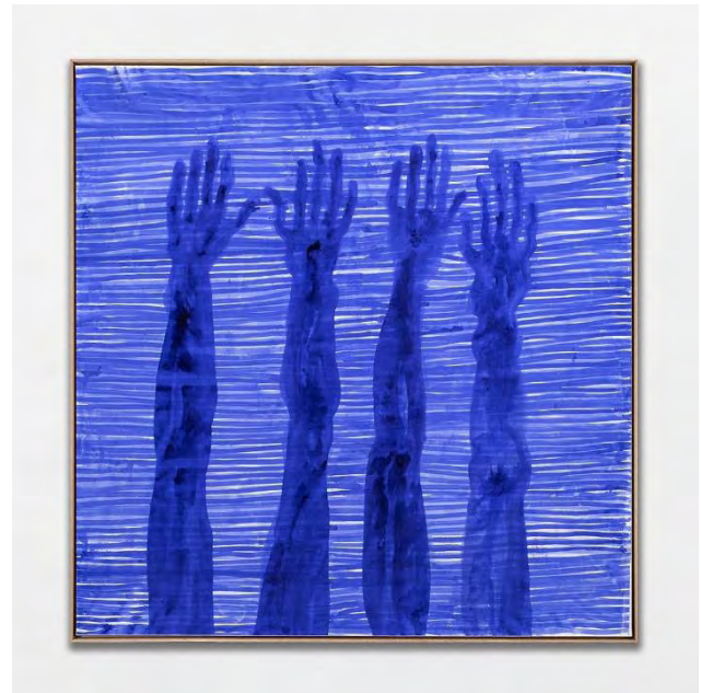
Partage VII , 2020, ink on canvas, 200 x 200 cm.