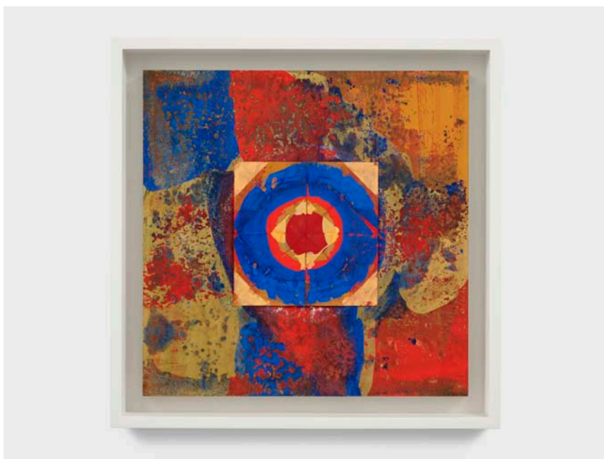
gabriel orozco folding stamps 16, 2013

gouache on paper on wood 18 x 18 x 1.5 in.