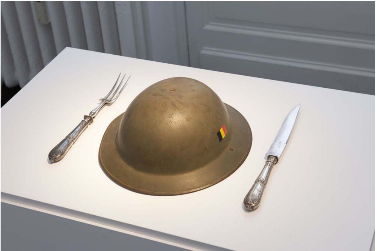
La Grande Bouffe, 2011 Knife, fork and helmet ca 42 x 30 x 14 cm / Pedestal: 92 x 80 x 50 cm Edition Unique