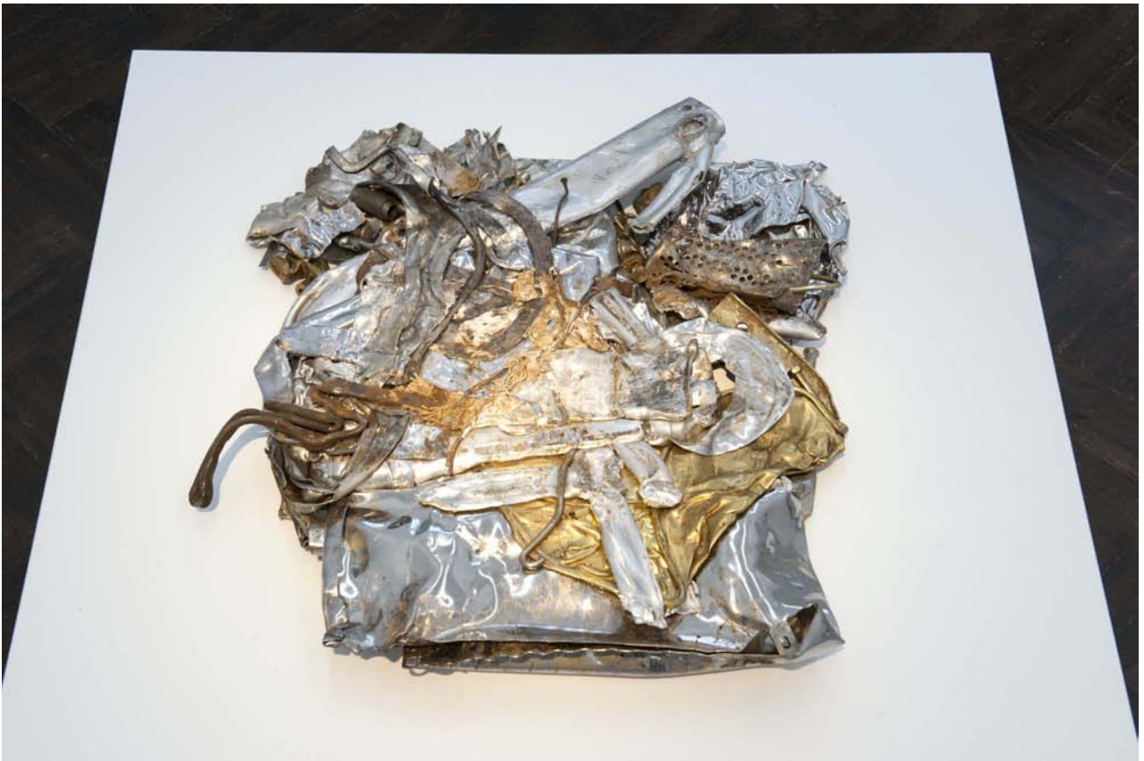
Industrial Devolution (left), 2012 Crushed objects 57 x 53 x 7 cm