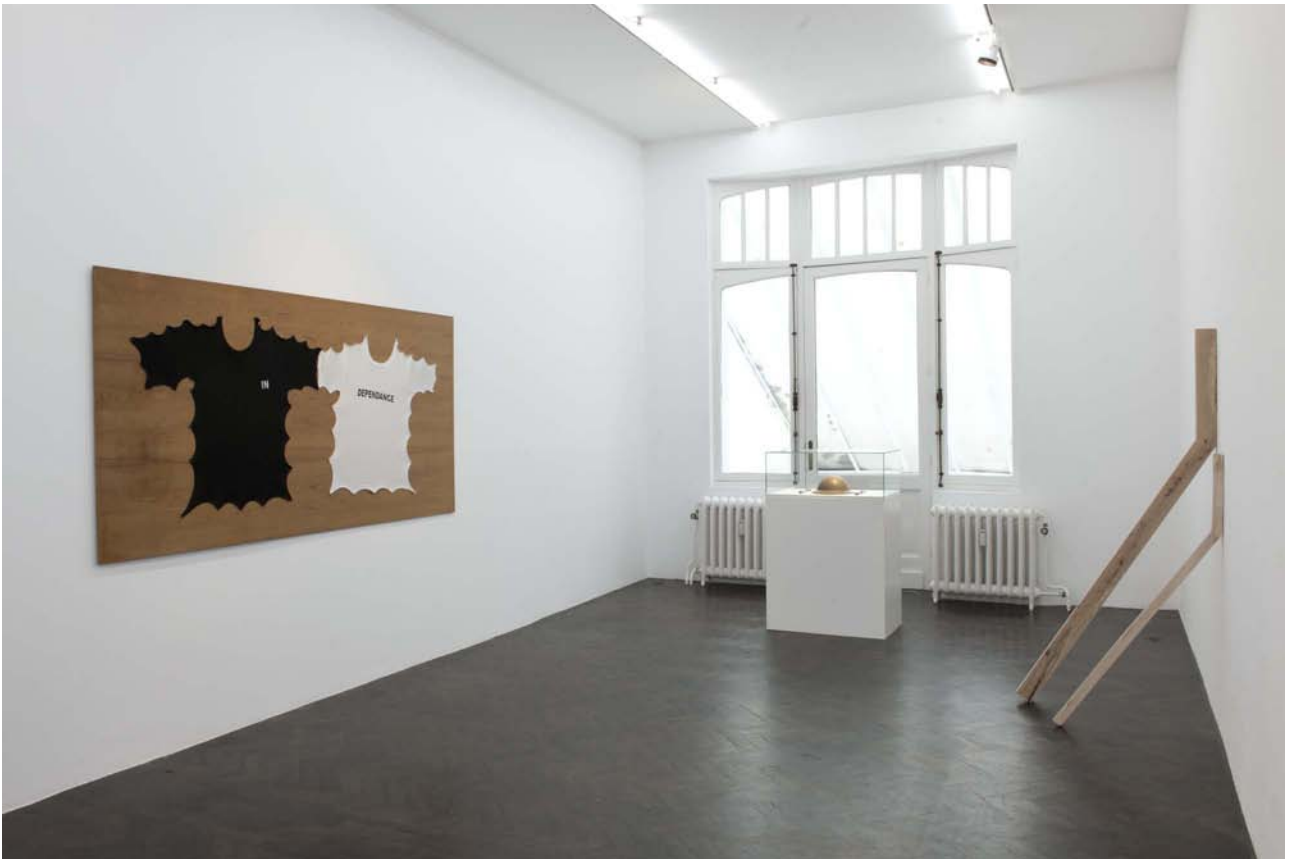
Exhibition view of IN_DEPENDANCE , Meessen De Clercq, 2012