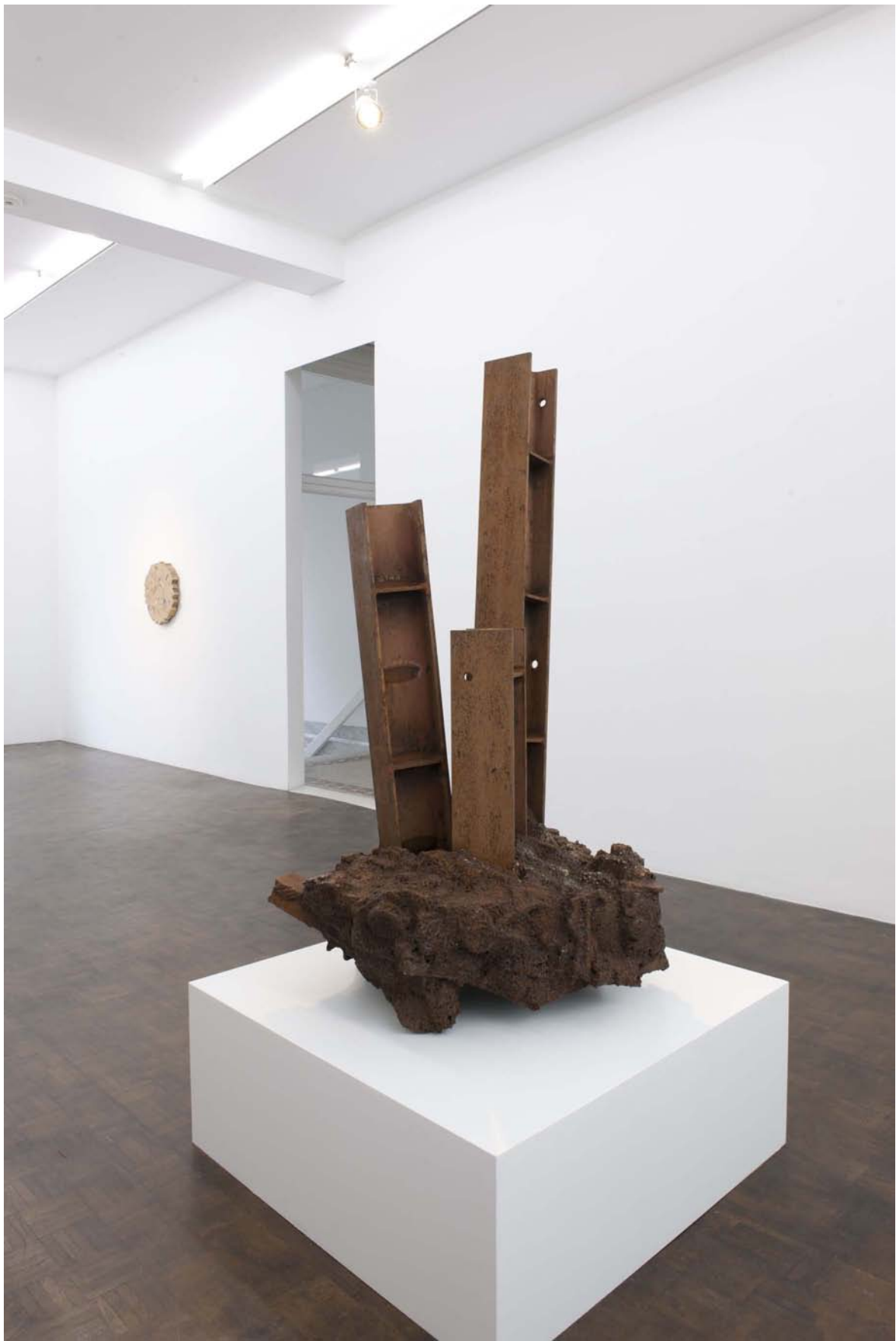
Genetologic Research Nr 25, 2006-2012 Iron Ore ca 153 x 95 x 90 / Pedestal: 40 x 100 x 100 cm Edition Unique