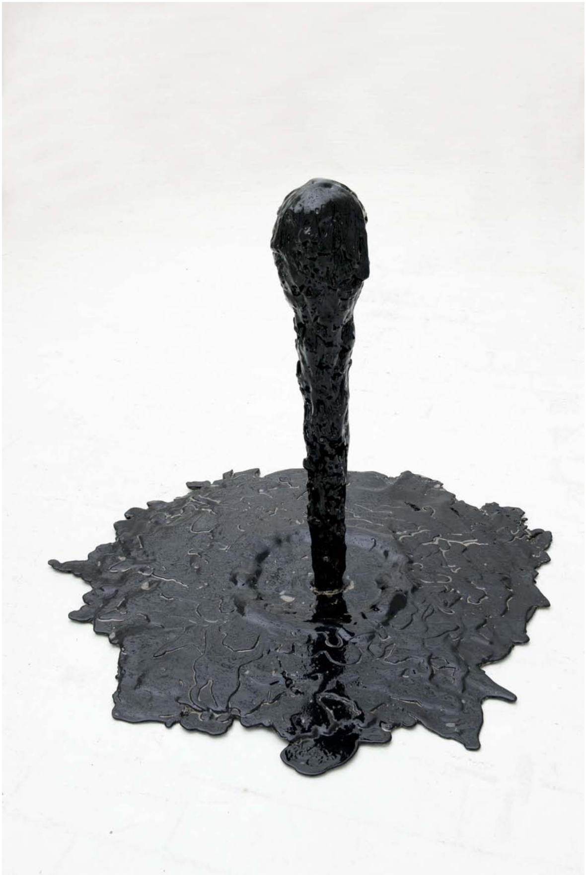
Oil Peak , 2012 Bronze ca 80 x 102 x 100 cm Edition Unique