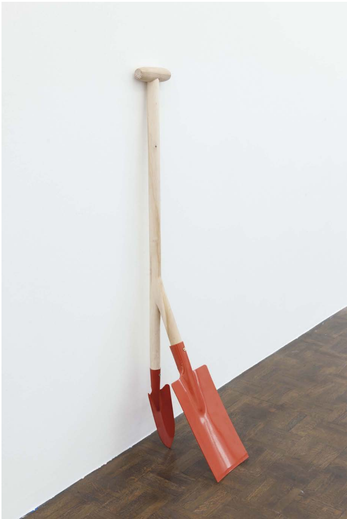
Genetologic Research Nr 34, 2012 Wood and metal ca 103 x 16 x 30 cm Edition Unique