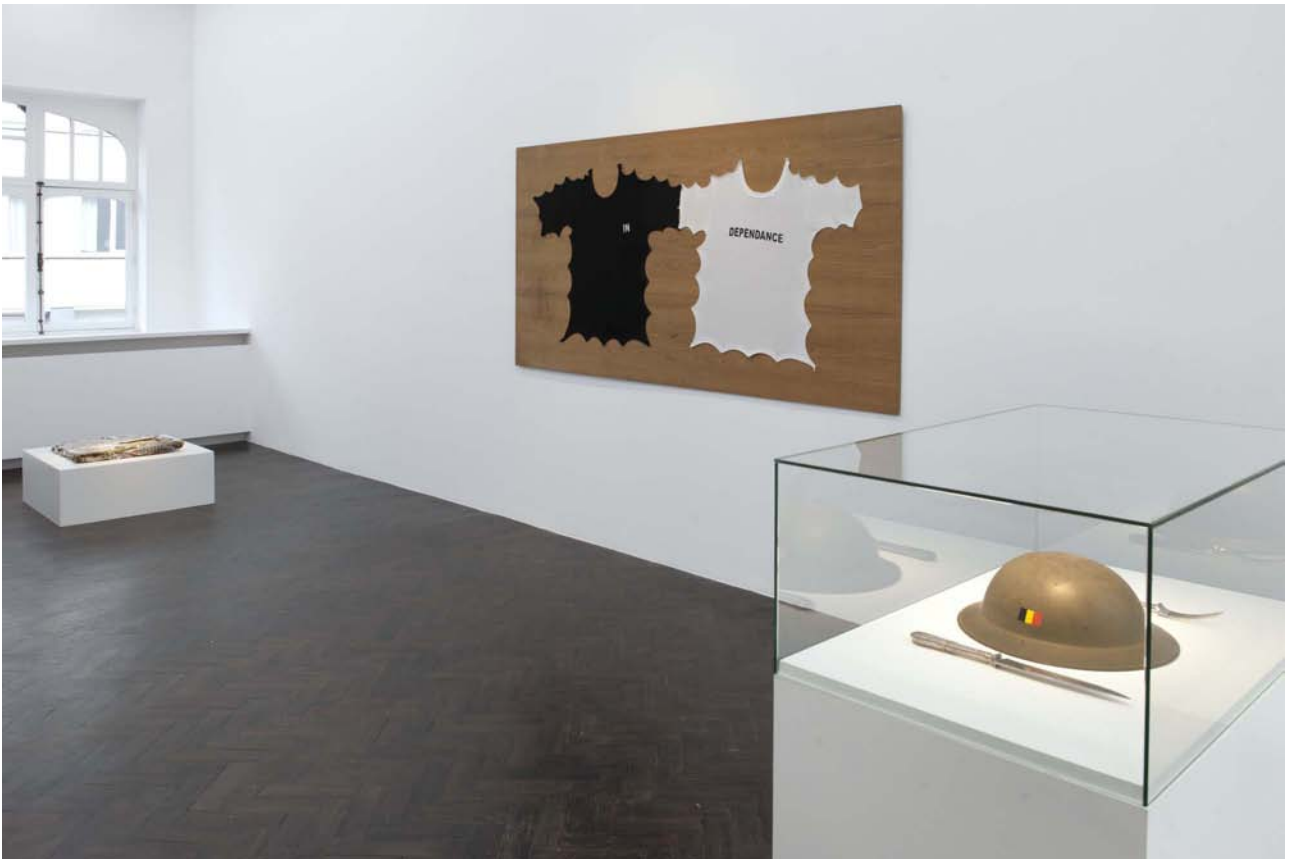
Exhibition view of IN_DEPENDANCE , Meessen De Clercq, 2012