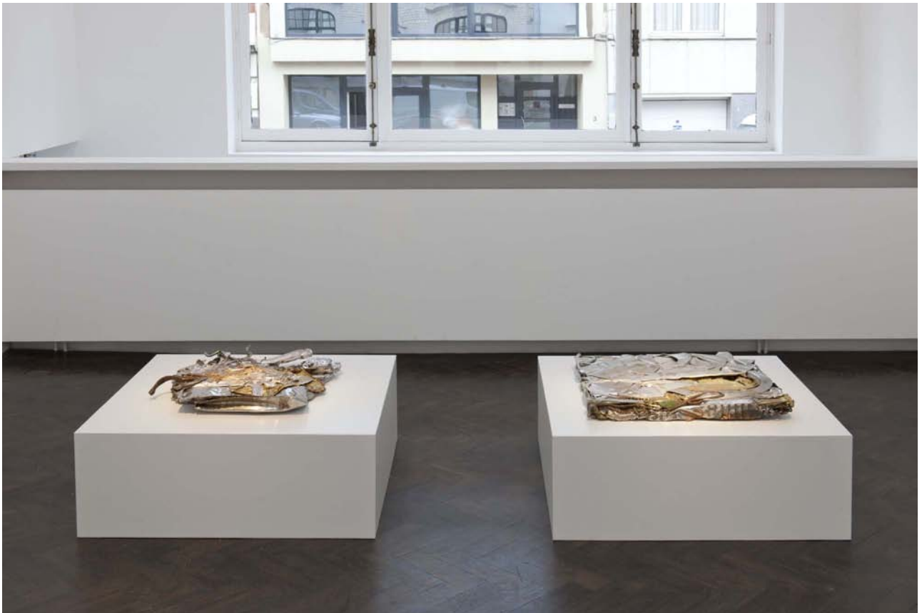
Industrial Devolution, 2012 Crushed objects 57 x 53 x 7 cm and 61 x 63 x 5 cm / Pedestal: 85 x 85 x 32 cm (each) Edition Unique