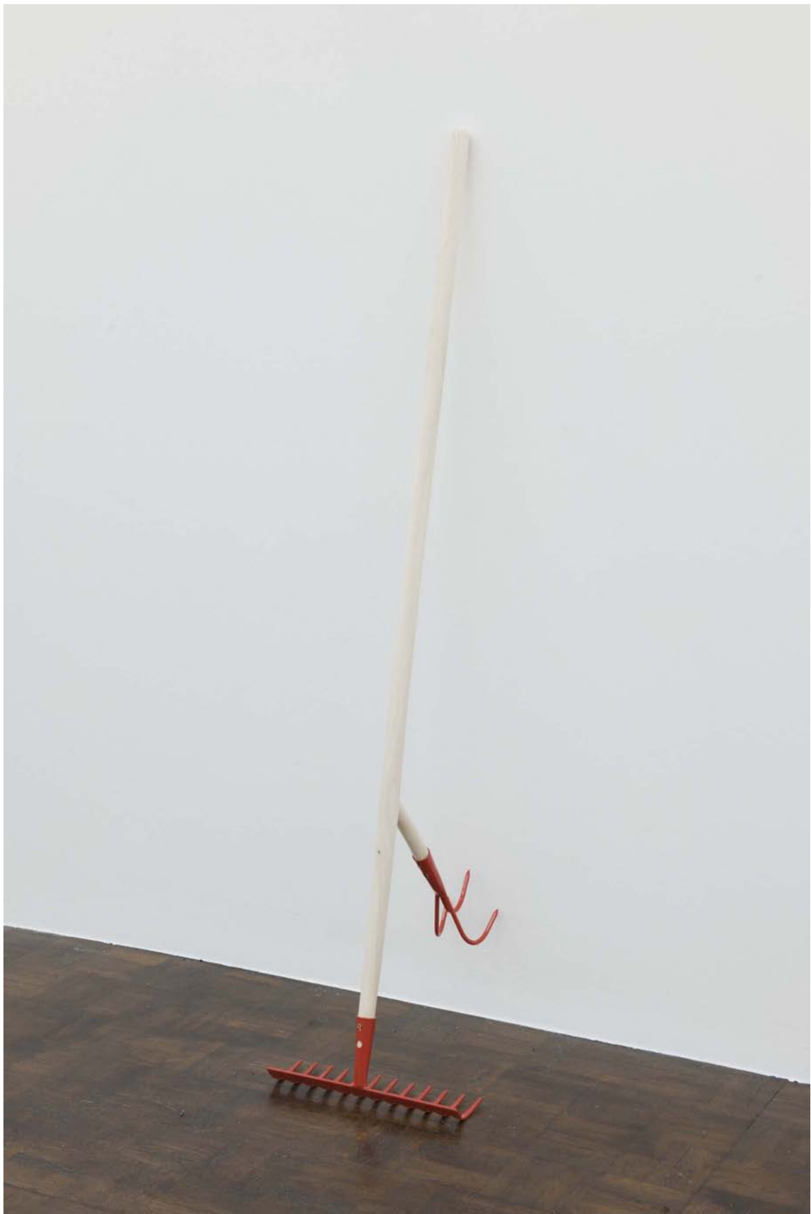
Genetologic Research Nr 36, 2012 Wood and metal ca 134 x 31 x 35 Edition Unique