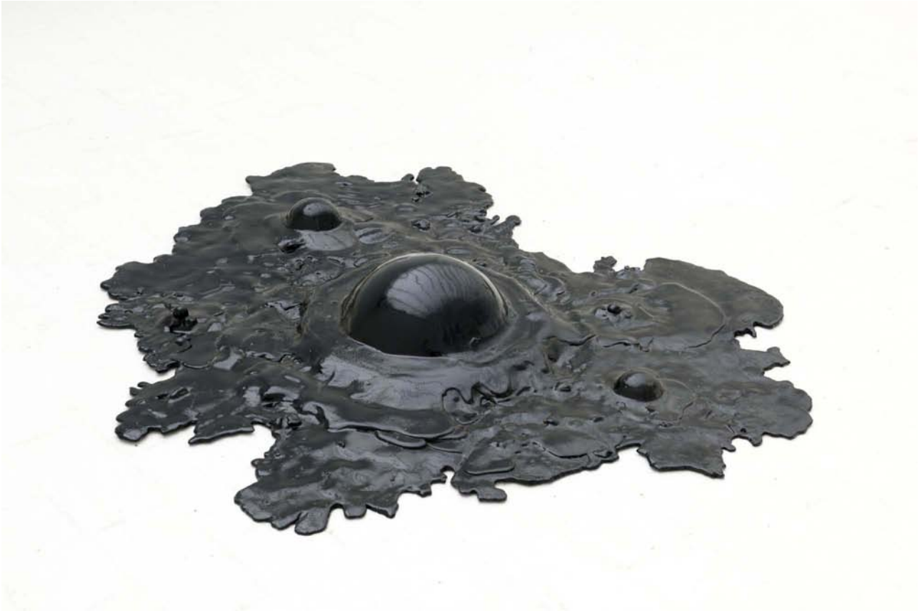
Oil Bubble , 2012 Bronze ca 15 x 120 x 105