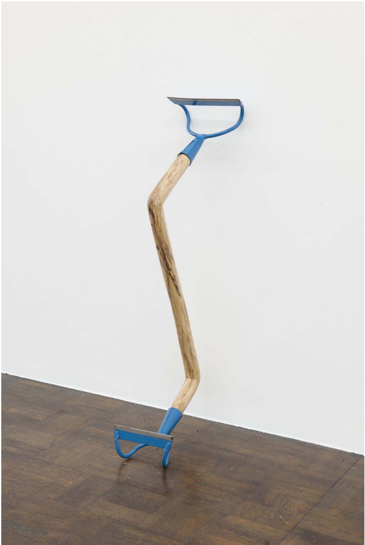
Genetologic Research Nr 35, 2012 Wood and metal ca 73 x 19 x 33 cm Edition Unique