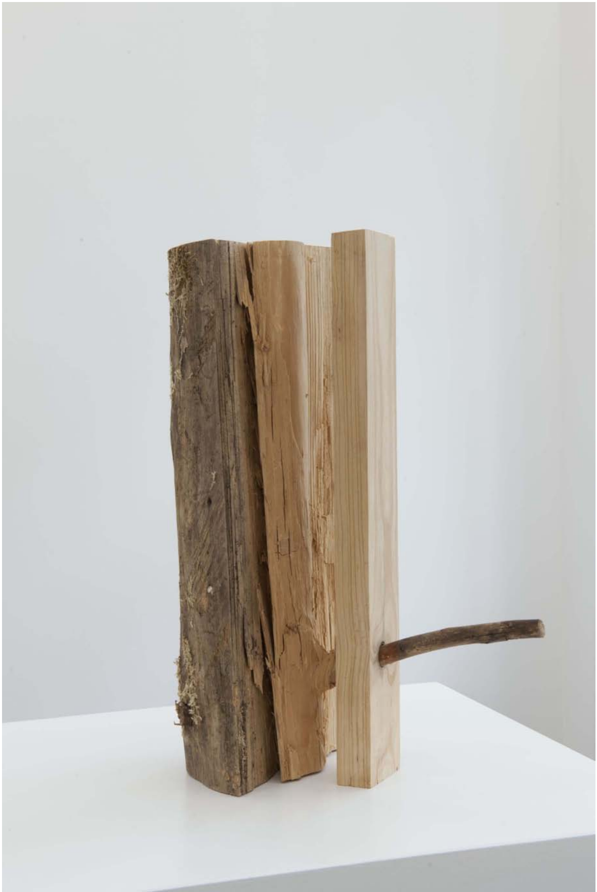
Genetologic Research Nr 32, 2010 Wood 35 x 25 x 15 cm / Pedestal: 100 x 40 x 40 cm Edition Unique