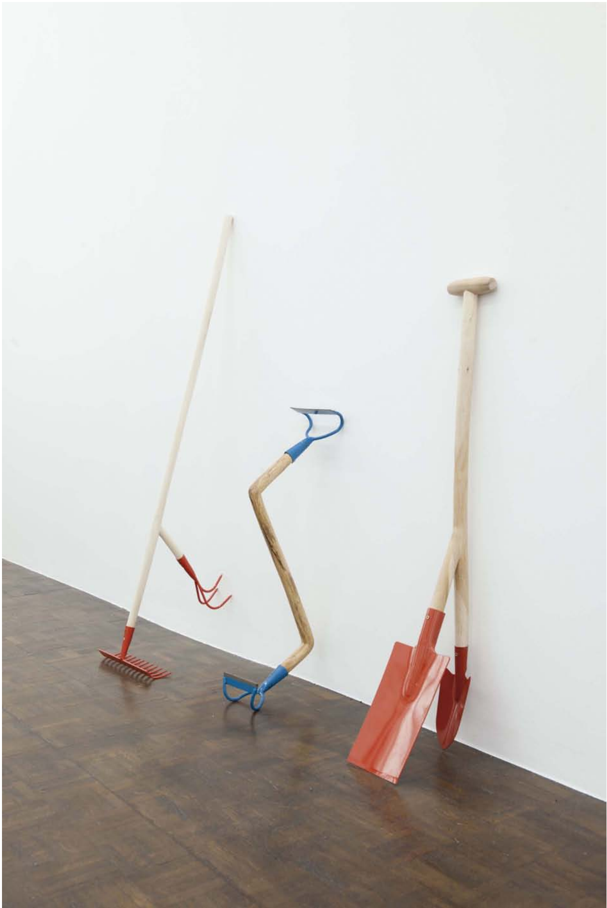
Exhibition view of IN_DEPENDANCE , Meessen De Clercq, 2012