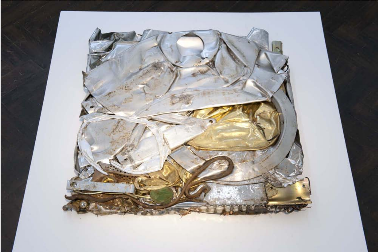
Industrial Devolution (left), 2012 Crushed objects 31 x 63 x 5 cm