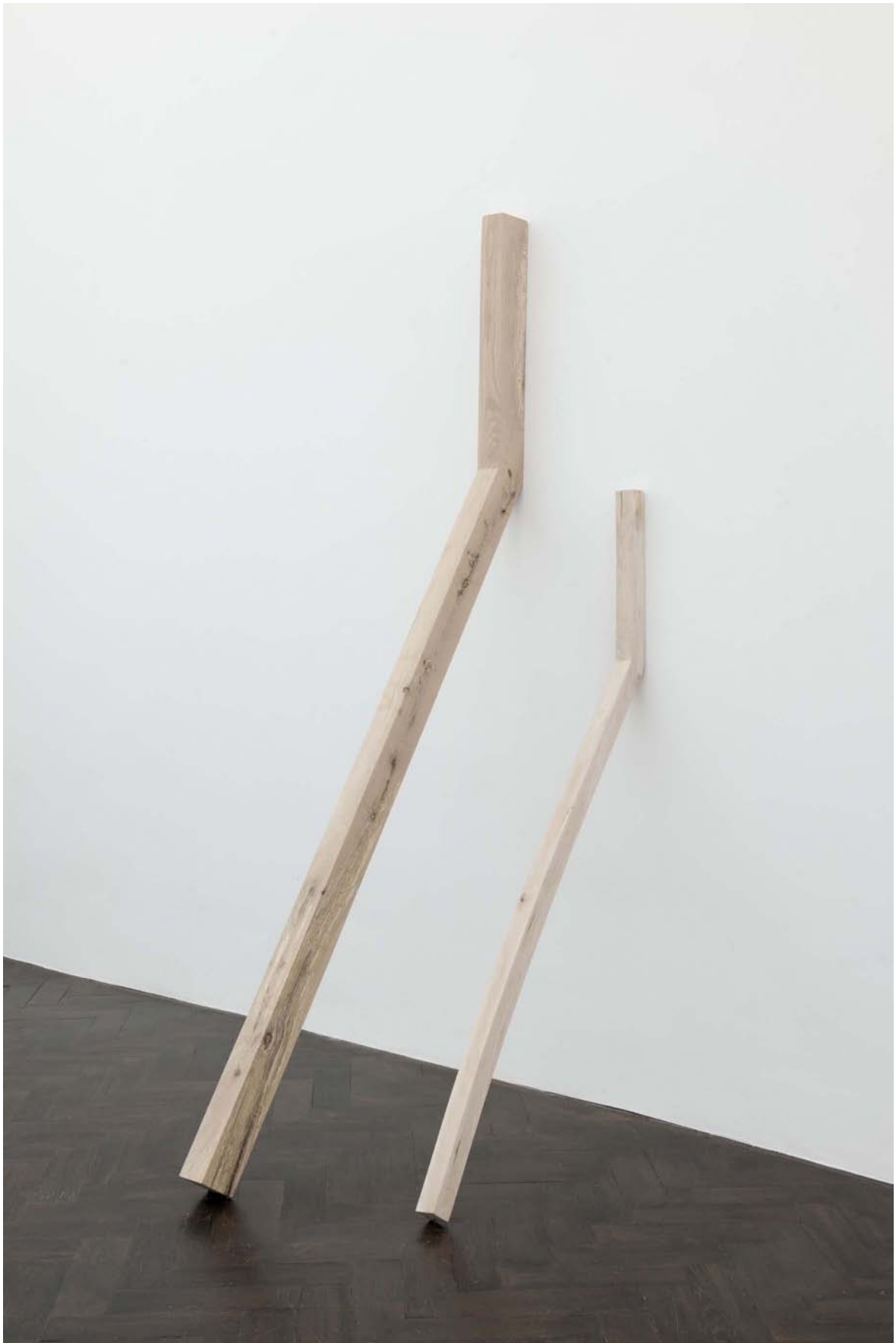
Genetologic Research Nr 33, 2010 Wood (two bent beams) ca 182 x 40 x 90 cm Edition Unique