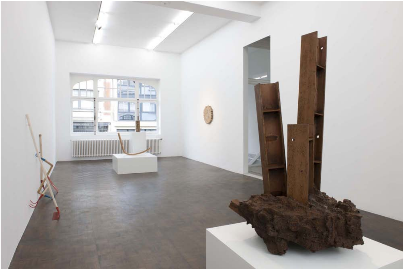
Exhibition view of IN_DEPENDANCE , Meessen De Clercq, 2012