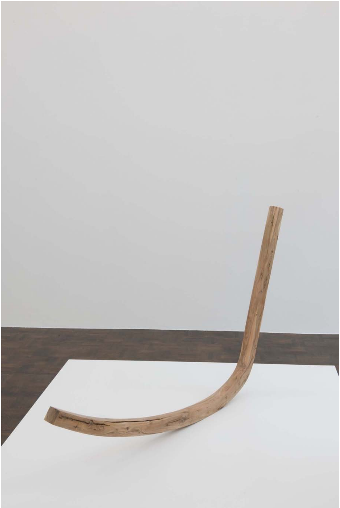
Slapstick , 2012 Wood, curved beam ca 60 x 90 x 4 cm / Pedestal: 40 x 100 x 100 cm Edition Unique