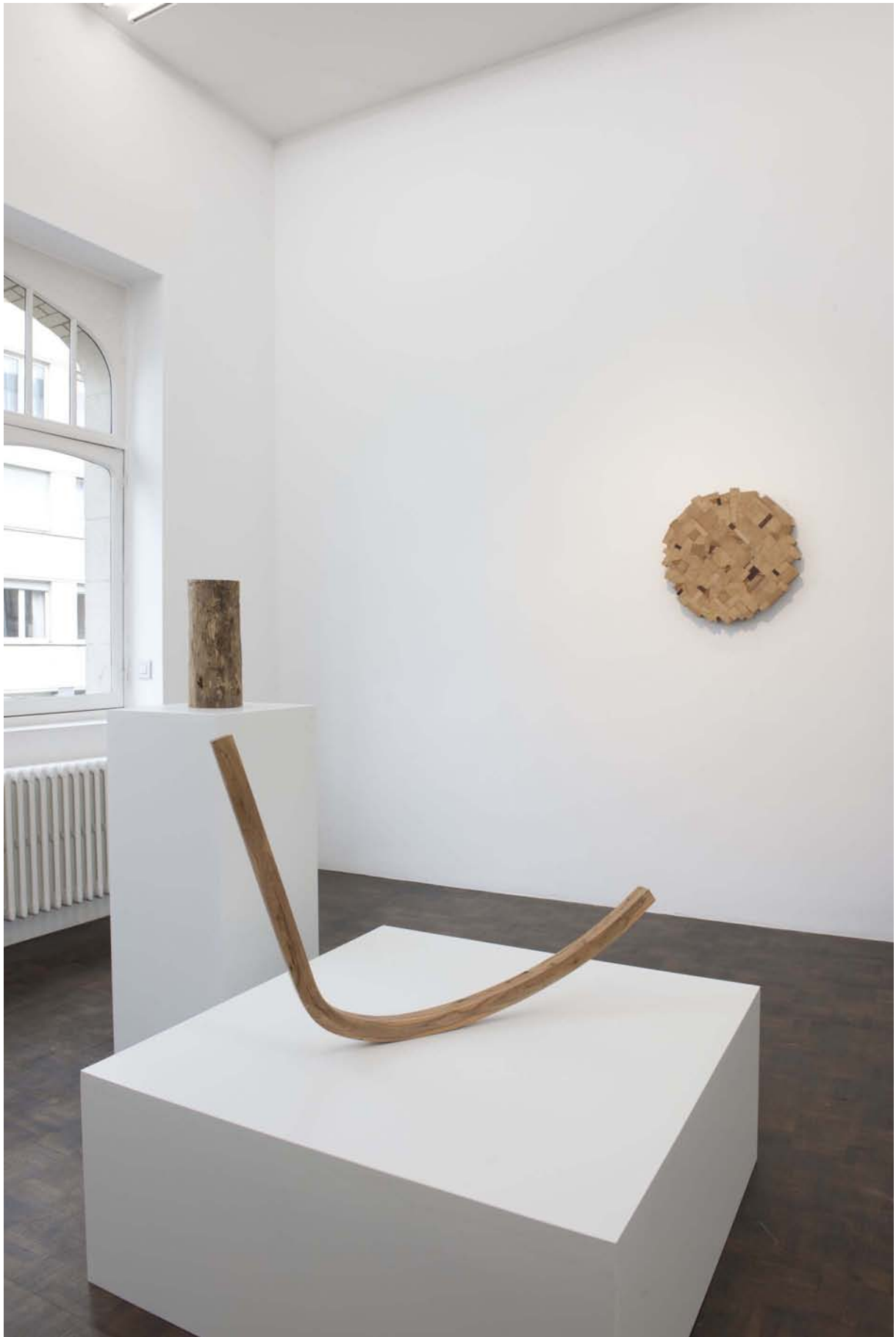
Exhibition view of IN_DEPENDANCE , Meessen De Clercq, 2012