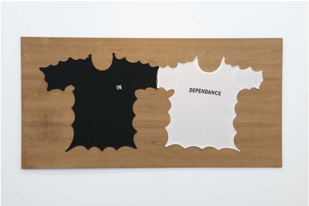
IN_DEPENDANCE , 2012 ply wood, t-shirts 122 x 244 cm x 3,5 cm Edition of 2