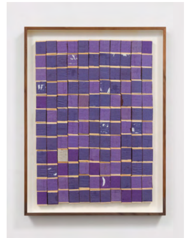
ANTONIO TARSIS O céu em pedaços (Sky in pieces) IV, 2021

Collage on paper 12 5/8 x 9 1/2 in (32 x 24 cm.) (AR21-001)