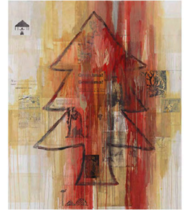
JAUNE QUICK-TO-SEE SMITH I See Red: Grandma! Grandma! (Red in the Hood), 1998

Exhibited as: live television broadcast on a monitor, vinyl lettering 13 3/4 x 14 x 7 inches (34.9 x 35.6 x 17.8 cm.) (GRB21-001)