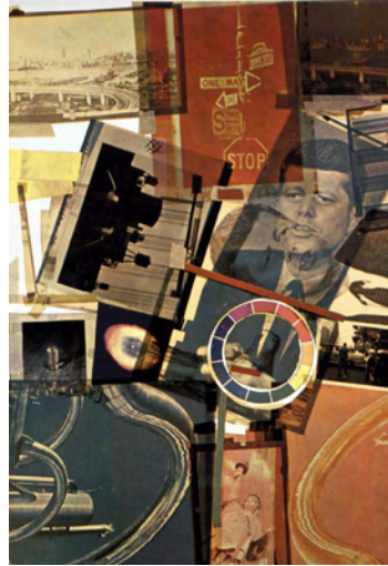
ROBERT RAUSCHENBERG Poster for CORE (Congress of Racial Equality), 1965

Photo montage 24 x 21 inches (61 x 53.3 cm.) Edition of 10 plus 2 artist's proofs (MAR21-001)