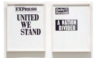
SARAH CHARLESWORTH United We Stand/A Nation Divided , 1978

Signed on verso Fuji Crystal Archive print 21 3/4 x 13 1/2 in (55.2 x 34.3 cm) Edition 2 of 5 plus 2 APs (SAC21-001.2)