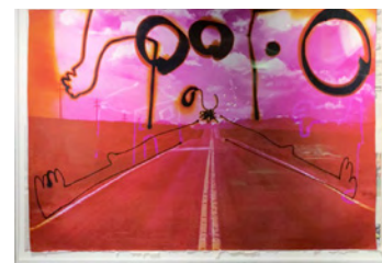
HADI FALLAHPISHEH On The Road

Photographic emulsion and enamel on canvas 31 1/2 x 43 1/4 in (80 x 110 cm.) (MAS21-004)