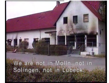
HITO STEYERL Babenhausen , 1997

Wood, aqua resin, casein, paper 58 x 47 x 1 1/2 in (147.3 x 119.4 x 3.8 cm.) (SAB21-001)