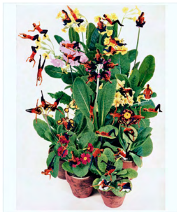
MARTHA ROSLER Flower Power , from the series Body Beautiful, or Beauty Knows No Pain , c. 1966-72

Print book 50 pages illustrations (some color)