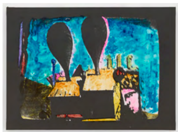
MARIO SCHIFANO Untitled (ore 22,15 maestro italiano del '900 - 10:15 p.m. Omaggio a de Chirico / Italian Masters of the 1900 - Homage to de Chirico) , 1976

Photographic emulsion and enamel on canvas 31 1/2 x 43 1/4 in (80 x 110 cm.) (MAS21-001)