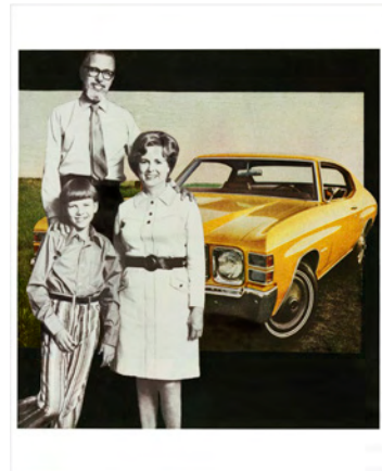
MARTHA ROSLER Family Portrait with Car , from the series Body Beautiful, or Beauty Knows No Pain , c. 1966- 72

Photomontage 24 x 20 in (61 x 50.8 cm.) Edition 1 of 10 plus 2 APs (MAR21-003.1)