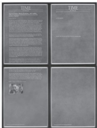
ANDREA BOWERS Eulogies to One and Another (Time World, 1 of 4; 2 of 4; 3 of 4; 4 of 4), 2006

Signed and dated on verso Mixed media on canvas 60 x 50 in (152.4 x 127 cm.) (JQS21-002)