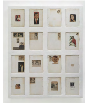
SADIE BENNING "F", 2018

Charcoal drawing on New York Times page from Sunday, June 22, 1986 22 x 13 3/4 in (55.9 x 34.9 cm.) (AP21-001)