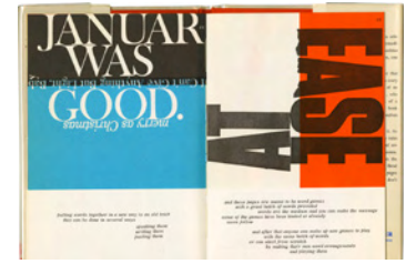
CORITA KENT footnote and headlines: a play- pray book , 1967

Acrylic on canvas 48 x 48 in (121.9 x 121.9 cm.) (BS21-001)