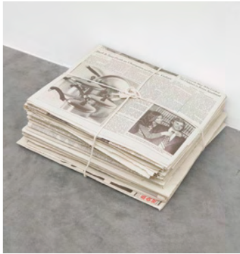
ROBERT GOBER Newspaper , 1992

Photolithography on archival Mohawk Superfine paper, twine 6 x 16 1/4 x 13 1/4 in (15.2 x 41.3 x 33.7 cm.) Edition 6 of 10 (RG21-001)