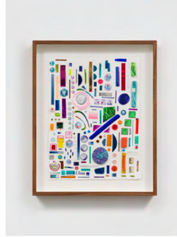
ANTONIO TARSIS Mining IV, 2021

Collage on paper 12 5/8 x 9 1/2 in (32 x 24 cm.) (AR21-002)