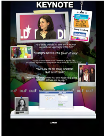
SIMON DENNY 13.10 KEYNOTE, 2013

UV print on a pretty glossy, white canvas 43 1/4 x 63 inches (110 x 160 cm.) (SID21-001)