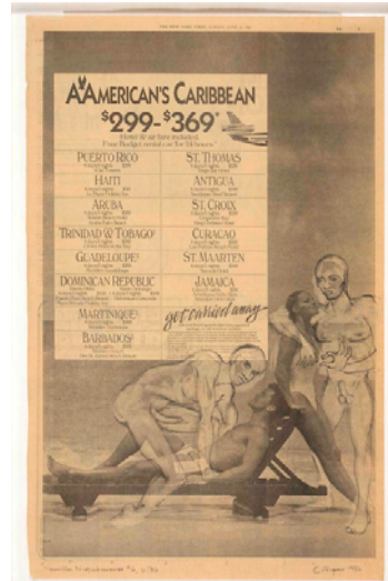
ADRIAN PIPER Vanilla Nightmares #6 , 1986

UV print on a pretty glossy, white canvas 43 1/4 x 63 inches (110 x 160 cm.) (SID21-001)