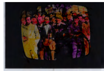
MARIO SCHIFANO Paesaggio TV , 1969-1970

Photographic emulsion and enamel on canvas 31 1/2 x 43 1/4 in (80 x 110 cm.) (MAS21-001)