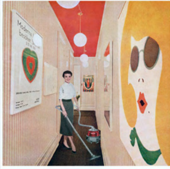
MARTHA ROSLER Vacuuming Pop Art, from the series Body Beautiful, or Beauty Knows No Pain, c. 1966-72

Photo montage 24 x 21 inches (61 x 53.3 cm.) Edition of 10 plus 2 artist's proofs (MAR21-001)