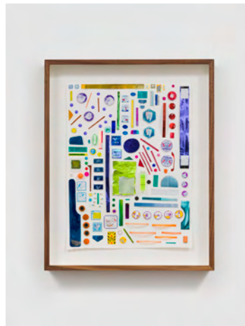
ANTONIO TARSIS Mining III, 2021

Graphite on paper 65 3/8 x 49 in (166 x 124.4 cm) (AB13-016)