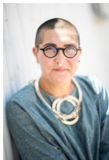
Tanya Aguiñiga [American, b. 1978]