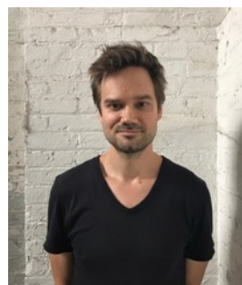
Thaddeus Wolfe [American, b. 1979]