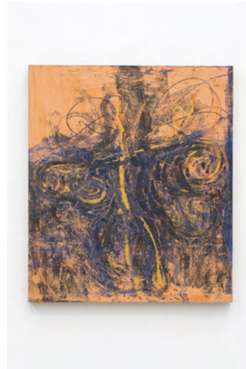
URI ARAN The Fastest Boy in the World , 2021

Oil pastel, silkscreen, colored pencil, graphite on MDO panel 17 × 14 ¾ × 1 inches (43.2 × 37.5 × 2.5 cm.) (UA21-021)