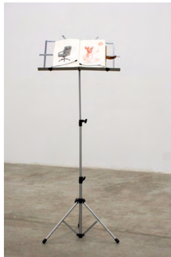
URI ARAN The Fastest Boy in the World , 2021

Oil, acrylic, wood stain, char- coal, graphite, oil pastel, color pencil and china marker on canvas 87 × 148 ½ × 1 ½ inches (221 × 377.2 × 3.8 cm.) (UA21-009)