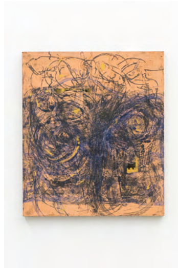
URI ARAN The Fastest Boy in the World , 2021

Single channel video, stereo sound 5 minutes, 1 second; 66 × 38 × 3 inches (167.6 × 96.5 × 7.6 cm.) on 85 inch Monitor (dimensions variable) Edition of 5 plus 2 APs (UA21-017)