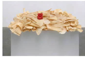
URI ARAN Untitled , 2020

Colored pencil, graphite, monoprint on book, music stand 47 × 20 × 20 inches (119.4 × 50.8 × 50.8 cm.) (UA21-023)