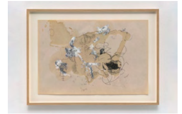
URI ARAN Clocks & Letters , 2021

Oil pastel, graphite, colored pencil on MDO panel 17 × 14 ¾ × 1 inches (43.2 × 37.5 × 2.5 cm.) (UA21-020)