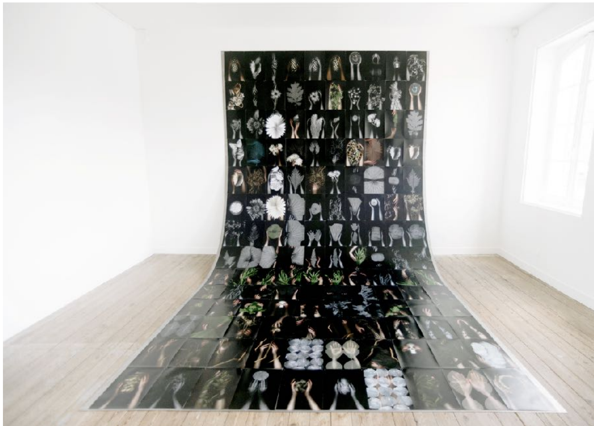
L'herbier lacustre, herbier de curiosités 2019 160 tirages sur papier couché 100g aimantés sur rampe acier sur mesure 41 x 29 cm chacun