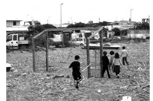
Originally published in the catalogue "Un'Espressione Geografica", Fondazione Sandretto Re Rebaudengo, Turin, Italy (Mousse Publishing 2011)