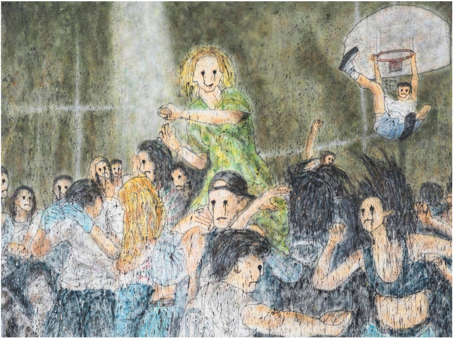
Untitled, 2021. Acrylic paint, aerosol on canvas. 230 x 306 cm.