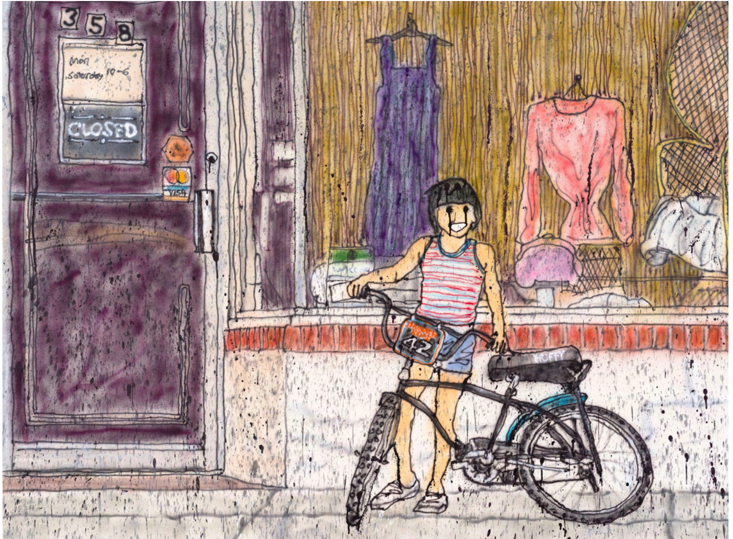
Untitled, 2021. Acrylic paint, aerosol on canvas. 120 x 160 cm. ©2021 MADSAKI/Kaikai Kiki Co., Ltd. All Rights Reserved. Courtesy Perrotin.