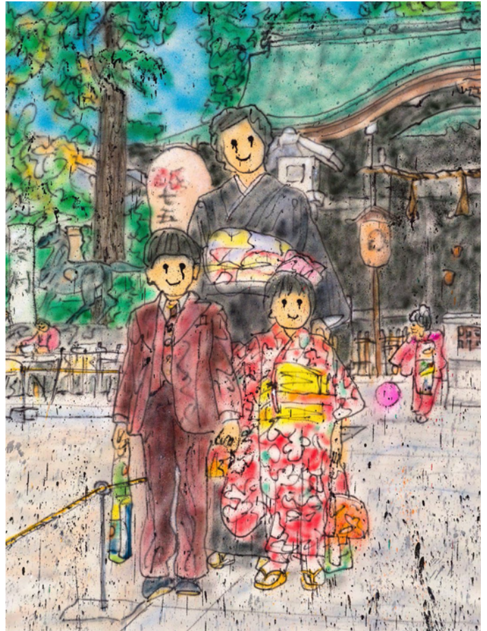
Untitled, 2020. Acrylic paint, aerosol on canvas. 160 x 120 cm.

This oscillation is manifested in the themes the artist conveys. For example, we see no distinction between Picasso's Three Musicians , a waitress from Twin Peaks , the McDonald's family, Reggie Jackson from the Yankees, and the Fresh Prince of Bel Air. Throughout multiple bodies of work, and without hesitation, Gauguin, Monet, Manet, Ingres, David, and Cézanne rub shoulders with Sonic Youth, Nirvana, The Ramones, The Cure, The Beastie Boys, Anthrax, and Flavor Flav. Painted in the same half-decade, MADSAKI moves seamlessly from Warhol's Double Elvis to Ronald Reagan on the ground after his assassination attempt. In his singular practice, it seems entirely plausible that Delacroix's Liberty Leading the People could lead the New York Knicks to their first NBA title or George Washington on his white horse could enter the famous CBGB.