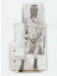
Kunle Martins Soil , 2021 Graphite and charcoal on found cardboard 45 ½ x 24 in (114.3 x 61cm) (KNM0004)