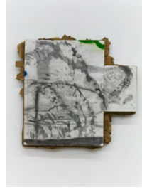
Kunle Martins Tommy , 2021 Graphite and charcoal on found cardboard 35 x 92 in (88.9 x 233.7cm) (KNM0009)