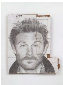
Kunle Martins Dan , 2021 Graphite and charcoal on found cardboard 65 x 55 ½ in (165.1 x 140.9cm) (KNM0005)