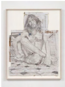
Kunle Martins Alex , 2019 Graphite on found cardboard Framed: 46 1/2 x 37 in (118.1 x 94 cm) (KNM0001)