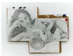
Kunle Martins Vashtie , 2021 Graphite and charcoal on found cardboard 48 ¾ x 65 in (123.8 x 165.1 cm) (KNM0007)