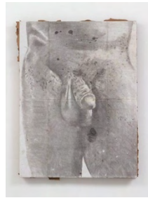
Kunle Martins Kunle , 2021 Graphite and charcoal on found cardboard 63 ¾ x 47 ½ in (160 x 119.4cm) (KNM0006)