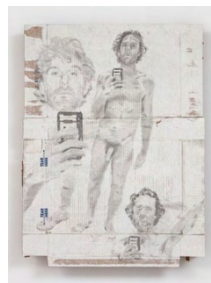
Kunle Martins Dan , 2021 Graphite and charcoal on found cardboard 32 1/2 x 24 in (82.6 x 61cm) (KNM0003)