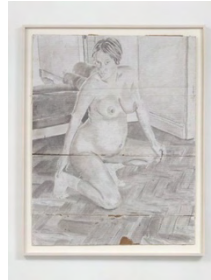
Kunle Martins Chloe , 2020 Graphite on found cardboard Framed: 46 x 36 in (116.8 x 91.4 cm) (KNM0002)