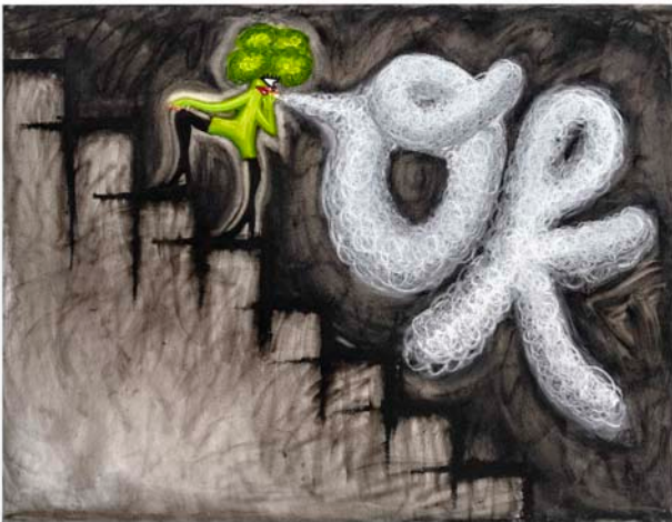
Hein Koh, It's OK , 2021 Oil and oil stick on canvas 54 x 70 inches (137.2 x 177.8 cm)