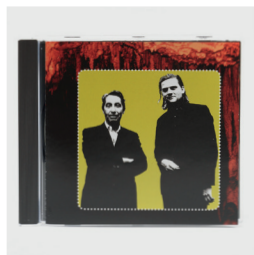
Boussiron / Labelle-Rojoux Le point d'orgue musical , 2009 Audio CD, 4 tracks. Co-production: Le Parvis centre d'art contemporain, Semiose, Loevenbruck, Paris. Cover photograph: Laurent Friquet.