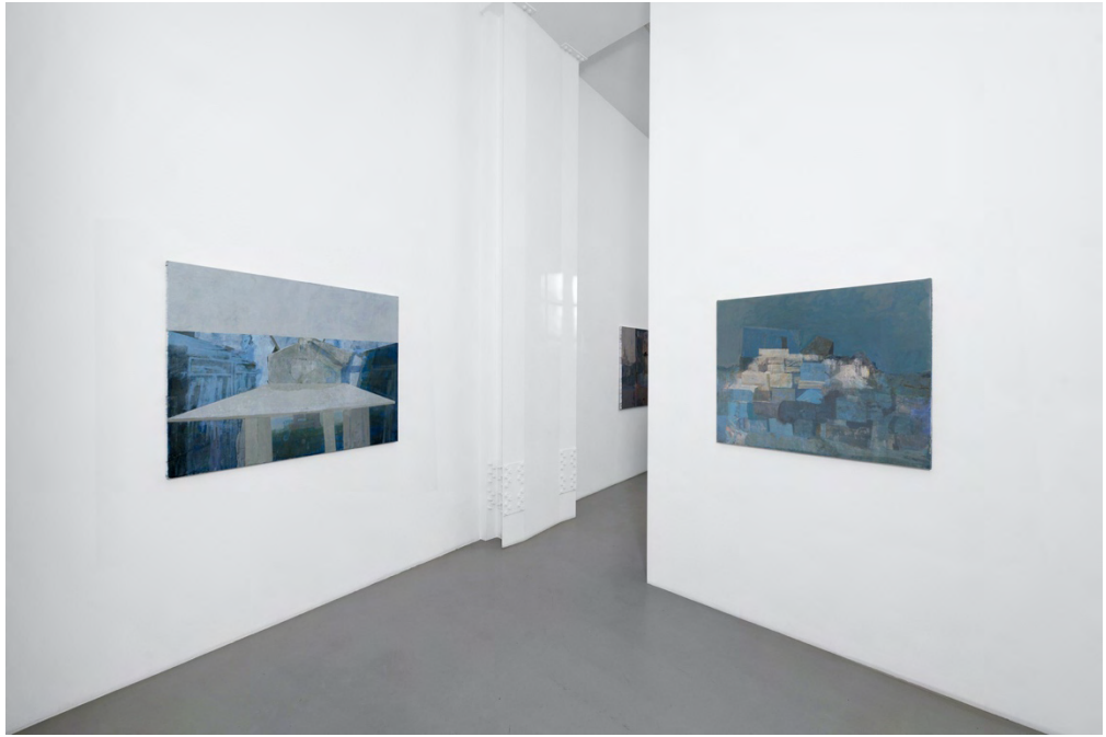
Prince of the Lake exhibition view at Galerie Mitterrand, Paris, 2021