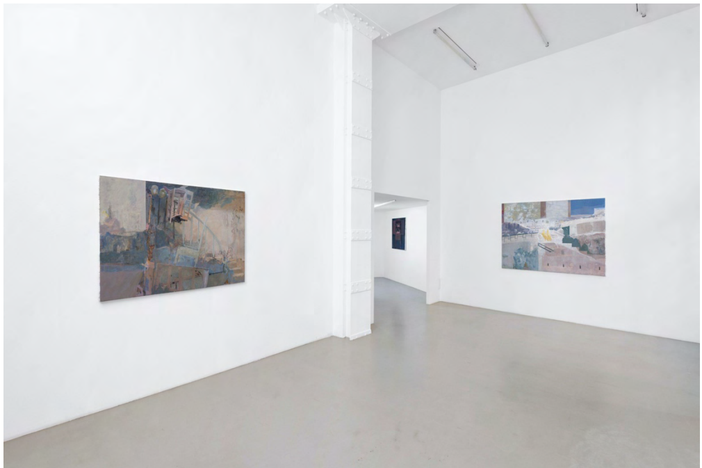
Prince of the Lake exhibition view at Galerie Mitterrand, Paris, 2021

79 RUE DU TEMPLE 75003 PARIS - T +33 1 43 26 12 05 F +33 1 46 33 44 83 INFO@GALERIEMITTERRAND.COM WWW.GALERIEMITTERRAND.COM