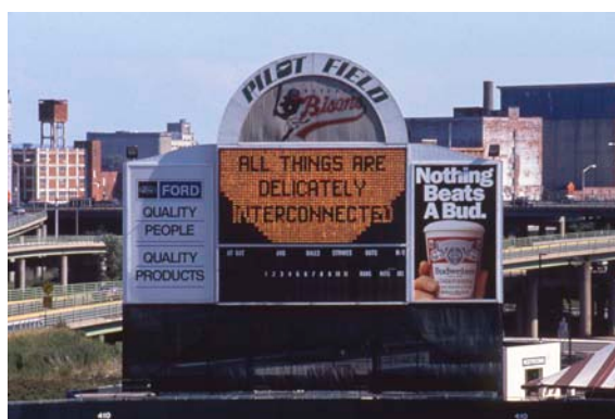
From Truisms (1977–79) Installation: Pilot Field, Buffalo, New York, USA, 1991