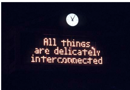
From Truisms (1977–79) Installation: In Other Words, Dupont Circle, Washington, DC, 1986