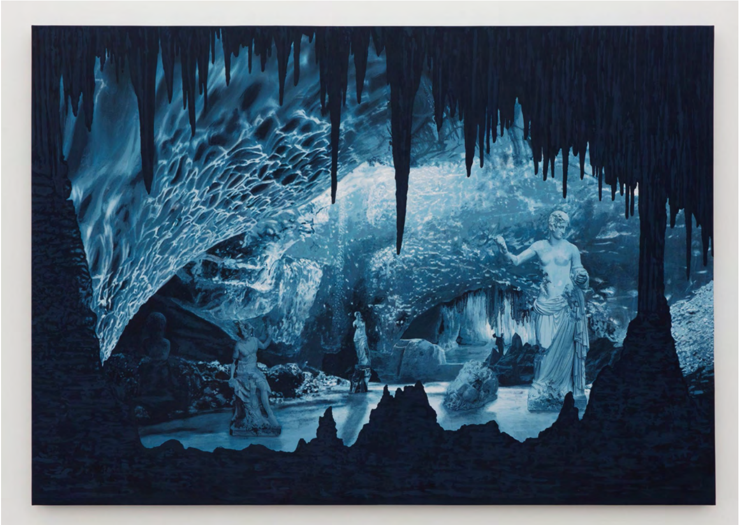
Cave of the Sublime, Iceland, 2020. Acrylic on canvas panel. 84 x 120 x 3 in.