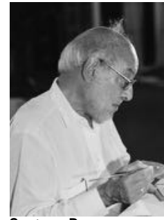
Gaetano Pesce [Italian, b. 1939]