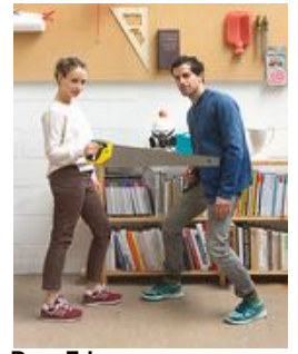
Raw-Edges [est. 2006, London]