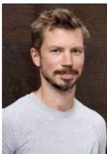
Joris Laarman [Dutch, b. 1979]