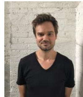
Thaddeus Wolfe [American, b. 1979]