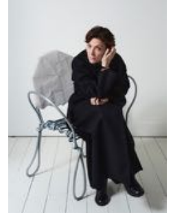
Faye Toogood [British, b. 1977]