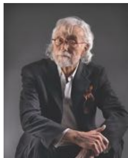
Wendell Castle [American, 1932-2018]