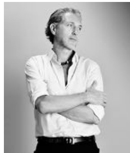
Marcel Wanders [Dutch, b. 1963]