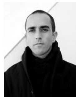
Raphael Navot [Israeli, b. 1977]