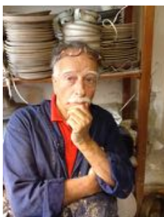
Bruno Gambone [Italian, b. 1936]