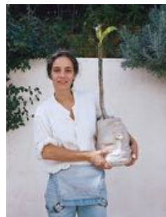
Carmen D'Apollonio [Swiss, b. 1973]