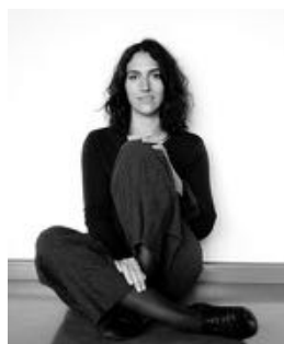
Najla El Zein [Lebanese, French b. 1983]