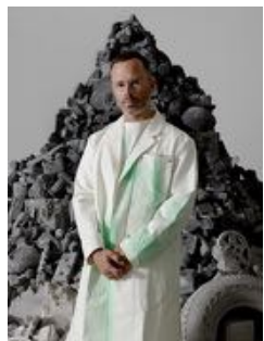
Daniel Arsham [American, b. 1980]