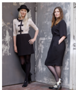
Front Design [est. 2004, Sweden]