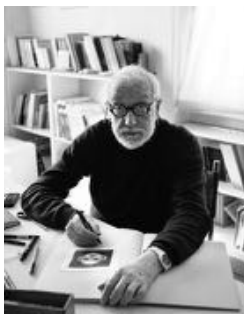
Andrea Branzi [Italian, b. 1938]