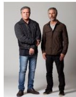
Estudio Campana [est. 1983, São Paulo]