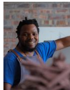
Andile Dyalvane [South African, b. 1978]