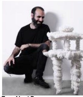
Erez Nevi Pana [Israeli, b. 1983]