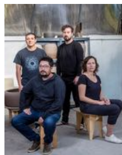
gT2P (Great Things to People) [est. 2009, Santiago]