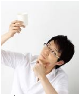
nendo [est. 2002, Tokyo]