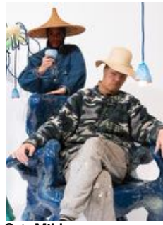
OrtaMiklos [est. 2015, Paris and Eindhoven]