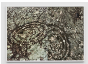
Josephine Pryde Exterior, Night, Day (Window), 2020 Giclée print mounted on aludibond 92.5 x 129.3 cm (36 3/8 x 50 7/8 in.) Edition of 3