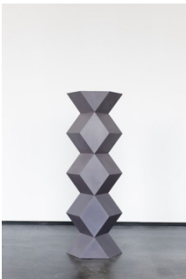
Angela Bulloch Never Ending with iPad, 2015 Stack of four regular waisted forms, grey oiled MDF with iPad 120 x 42 x 30 cm (47 1/4 x 16 1/2 x 11 3/4 in.)