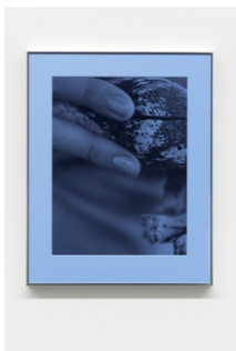
Josephine Pryde Pacific Driftwood (Blue Filter), 2014/2020 Black and white resin-coated print, coloured perspex 79.2 x 62.7 cm (31 1/8 x 24 3/4 in.) Edition of 3