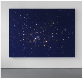
Angela Bulloch Night Sky Blue: Jupiter & Saturn in Capricorn.12, 2020 LED-Installation, felt, aluminium profiles, cables 200 x 266 cm (78 3/4 x 104 3/4 in.)