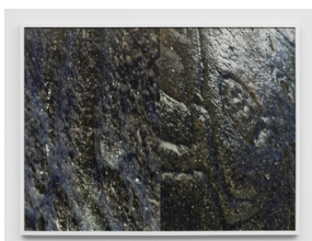
Josephine Pryde Exterior, Night, Day (Door), 2020 Giclée print mounted on aludibond 92.3 x 122.3 cm (36 3/8 x 48 1/8 in.) Edition of 3