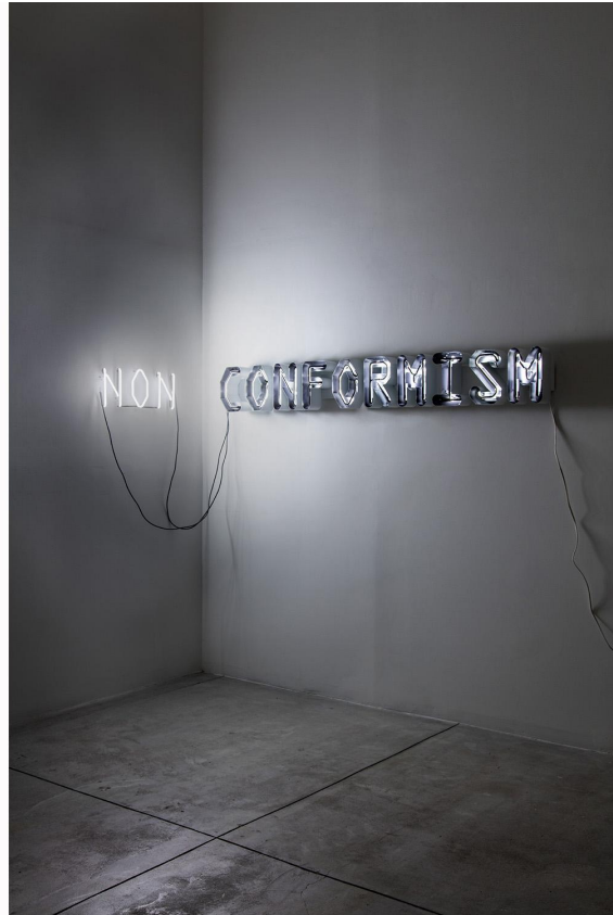
Untitled (N.C.) , 2020, 9.5 x 95 in / 24.1 x 241.3 cm

GAVLAK Palm Beach is pleased to present: Vox Populi , an exhibition of new neon works by New York-based artist Maynard Monrow. This is Monrow's third solo exhibition with the gallery.