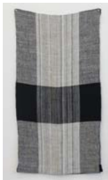
A-Z Personal Panels (White and Black Dress)