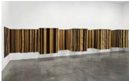
Installation of Nine "A-Z Cover Series 1 (Gold and Black Stripes)"

2012 watercolor on paper 9 x 17 inches (22.9 x 43.2 cm) Frame size: 11 1/4 x 19 1/4 x 1 3/4 inches (28.6 x 48.9 x 4.4 cm) ARG# ZA2012-031