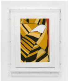
Tatiana with Cover up close 2012 gouache on paper 9 1/2 x 11 inches (53.3 x 27.9 cm) Frame size: 14 1/4 x 11 1/4 x 1 3/4 inches (36.2 x 28.6 x 4.4 cm) ARG# ZA2012-058