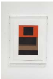
Study for A-Z Cover Series 2 (Rust and Brown Geometric) 2012 gouache on paper 12 x 9 inches (30.5 x 22.9 cm) Frame Size: 14 1/4 x 11 1/4 x 1 3/4 inches (36.2 x 28.6 x 4.4 cm) ARG# ZA2012-045