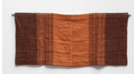
A-Z Personal Panels (Wide Rust and Black Top) 2012 linen 19 1/2 x 42 3/4 inches (49.5 x 108.6 cm) ARG# ZA2012-088