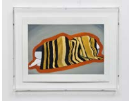
Patrick and Lani Cover shape 2012 gouache on paper 9 1/2 x 11 inches (53.3 x 27.9 cm) Frame size: 11 1/4 x 14 1/4 x 1 3/4 inches (28.6 x 36.2 x 4.4 cm) ARG# ZA2012-060