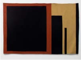
A-Z Cover Series 2 (Rust and Gold Geometric) 2012 wool 76 1/4 x 52 1/4 inches (193.7 x 132.7 cm) ARG# ZA2012-086