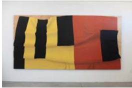
Prototype for Billboard: A-Z Cover Series 2 (Rust and Gold Geometric) 2012 enamel on plywood 72 5/16 x 145 1/4 x 2 inches (183.7 x 368.9 x 5.1 cm) ARG# ZA2012-046