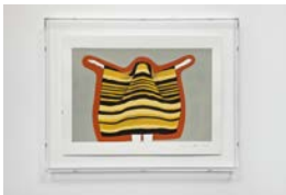
Tatiana with Cover

2012 gouache on paper 9 1/2 x 11 inches (53.3 x 27.9 cm) Frame size: 11 1/4 x 14 1/4 x 1 3/4 inches (28.6 x 36.2 x 4.4 cm) ARG# ZA2012-059