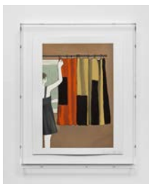
Cover in window at guest cabin at A-Z West 2012 gouache on paper 9 1/2 x 11 inches (53.3 x 27.9 cm) Frame size: 14 1/4 x 11 1/4 x 1 3/4 inches (36.2 x 28.6 x 4.4 cm) ARG# ZA2012-064