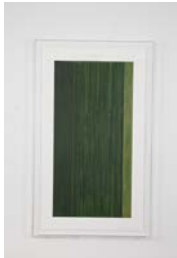
Study for A-Z Sleep Sack 2012 gouache on paper 30 1/8 x 17 inches (76.5 x 43.2 cm) Frame size: 32 3/8 x 19 3/8 x 1 3/4 inches (82.2 x 49.2 x 4.4 cm) ARG# ZA2012-055