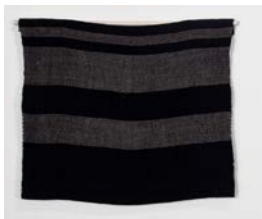
A-Z Personal Panels (Small Grey and Black Top) 2012 linen 19 x 22 1/2 inches (48.3 x 57.2 cm) ARG# ZA2012-066