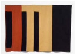
A-Z Cover Series 2 (Rust and Gold Geometric) 2012 wool 74 1/4 x 52 1/4 inches (188.6 x 132.7 cm) ARG# ZA2012-080