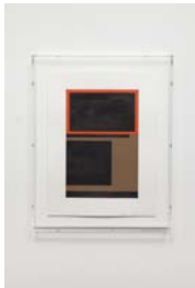
Study for A-Z Cover Series 2 (Rust and Brown Geometric) 2012 gouache on paper 12 x 9 inches (30.5 x 22.9 cm) Frame Size: 14 1/4 x 11 1/4 x 1 3/4 inches (36.2 x 28.6 x 4.4 cm) ARG# ZA2012-044