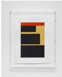
Study for A-Z Cover Series 2 (Rust and Gold Geometric)