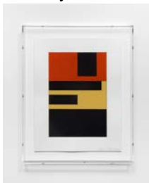
Study for A-Z Cover Series 2 (Rust and Gold Geometric) 2012 gouache on paper 12 x 9 inches (30.5 x 22.9 cm) Frame Size: 14 1/4 x 11 1/4 x 1 3/4 inches (36.2 x 28.6 x 4.4 cm) ARG# ZA2012-038