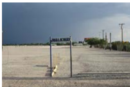
Dynamic Essay about the Panel 2012 power point presentation ARG# ZA2012-097