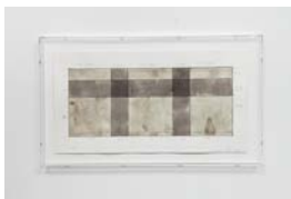
Study for A-Z Personal Panels (Wide Grey and Black Top) 2012 watercolor on paper 9 x 17 inches (22.9 x 43.2 cm) Frame size: 11 1/4 x 19 1/4 x 1 3/4 inches (28.6 x 48.9 x 4.4 cm) ARG# ZA2012-025