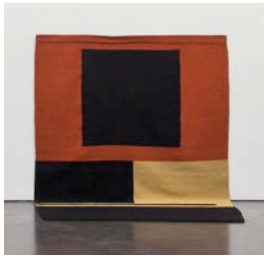
A-Z Cover Series 2 (Rust and Gold Geometric) 2012 wool 73 x 50 inches (185.4 x 127 cm) ARG# ZA2012-085