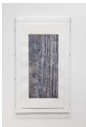
Study for A-Z Personal Panels (Variegated Blue and Black Dress)