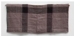
A-Z Personal Panels (Wide Grey and Black Top) 2012 linen 19 1/2 x 42 3/4 inches (49.5 x 108.6 cm) ARG# ZA2012-089