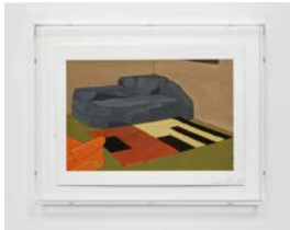
Cover on floor of guest cabin at A-Z West 2012 gouache on paper 9 1/2 x 11 inches (53.3 x 27.9 cm) Frame size: 11 1/4 x 14 1/4 x 1 3/4 inches (28.6 x 36.2 x 4.4 cm) ARG# ZA2012-061