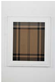
Study for A-Z Personal Panels (Poncho)