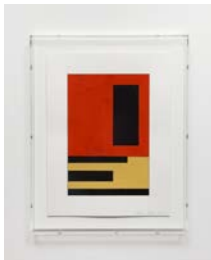
Study for A-Z Cover Series 2 (Rust and Gold Geometric) 2012 gouache on paper 12 x 9 inches (30.5 x 22.9 cm) Frame Size: 14 1/4 x 11 1/4 x 1 3/4 inches (36.2 x 28.6 x 4.4 cm) ARG# ZA2012-040