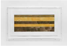
Study for A-Z Personal Panels (Wide Gold and Black Top)

2012 enamel on plywood 36 5/16 x 72 5/16 x 2 inches (92.2 x 183.7 x 5.1 cm) ARG# ZA2012-047