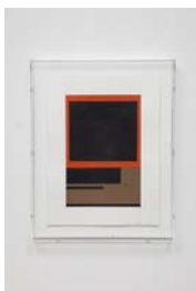
Study for A-Z Cover Series 2 (Rust and Brown Geometric) 2012 gouache on paper 12 x 9 inches (30.5 x 22.9 cm) Frame Size: 14 1/4 x 11 1/4 x 1 3/4 inches (36.2 x 28.6 x 4.4 cm) ARG# ZA2012-043