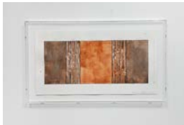
Study for A-Z Personal Panels (Wide Rust and Black Top) 2012 watercolor on paper 9 x 17 inches (22.9 x 43.2 cm) Frame size: 11 1/4 x 19 1/4 x 1 3/4 inches (28.6 x 48.9 x 4.4 cm) ARG# ZA2012-024