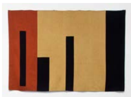
A-Z Cover Series 2 (Rust and Gold Geometric) 2012 wool 74 x 51 3/4 inches (188 x 131.4 cm) ARG# ZA2012-081