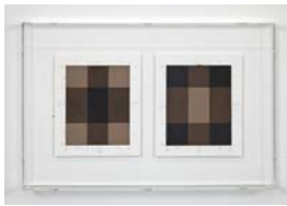
Study for A-Z Panel Bags