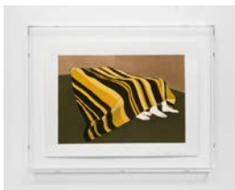
Patrick and Lani low Cover shape 2012 gouache on paper 9 1/2 x 11 inches (53.3 x 27.9 cm) Frame size: 11 1/4 x 14 1/4 x 1 3/4 inches (28.6 x 36.2 x 4.4 cm) ARG# ZA2012-056