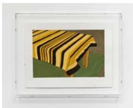
Studio table with Cover 2012 gouache on paper 9 1/2 x 11 inches (53.3 x 27.9 cm) Frame size: 11 1/4 x 14 1/4 x 1 3/4 inches (28.6 x 36.2 x 4.4 cm) ARG# ZA2012-057