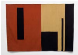
A-Z Cover Series 2 (Rust and Gold Geometric) 2012 wool 73 1/8 x 53 inches (185.7 x 134.6 cm) ARG# ZA2012-079