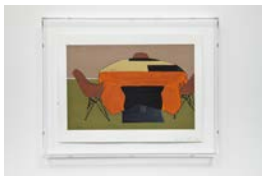
Cover on table in guest cabin at A-Z West