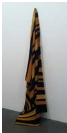
A-Z Cover Series 1 (Gold and Black Stripes) 2012 wool 54 x 74 inches (137.2 x 188 cm) ARG# ZA2012-067