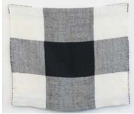
A-Z Personal Panels (Small White and Black Top) 2012 linen 19 x 22 1/2 inches (48.3 x 57.2 cm) ARG# ZA2012-095