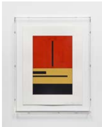
Study for A-Z Cover Series 2 (Rust and Gold Geometric)