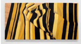
Prototype for Billboard: A-Z Cover Series 1 (Gold and Black Stripes)

2012 enamel on plywood 36 5/16 x 72 5/16 x 2 inches (92.2 x 183.7 x 5.1 cm) ARG# ZA2012-047