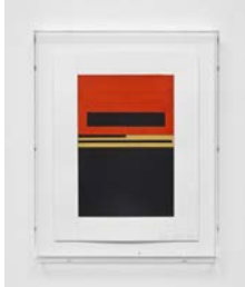
Study for A-Z Cover Series 2 (Rust and Gold Geometric)