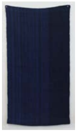
A-Z Personal Panels (Blue and Black Dress)