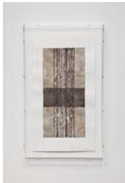
Study for A-Z Personal Panels (Variegated Grey and Black Dress)