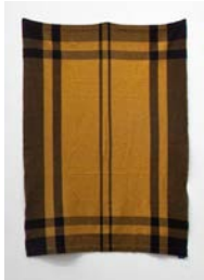
A-Z Personal Panels (Poncho) 2012 wool 73 x 52 3/4 inches (185.4 x 134 cm) ARG# ZA2012-065