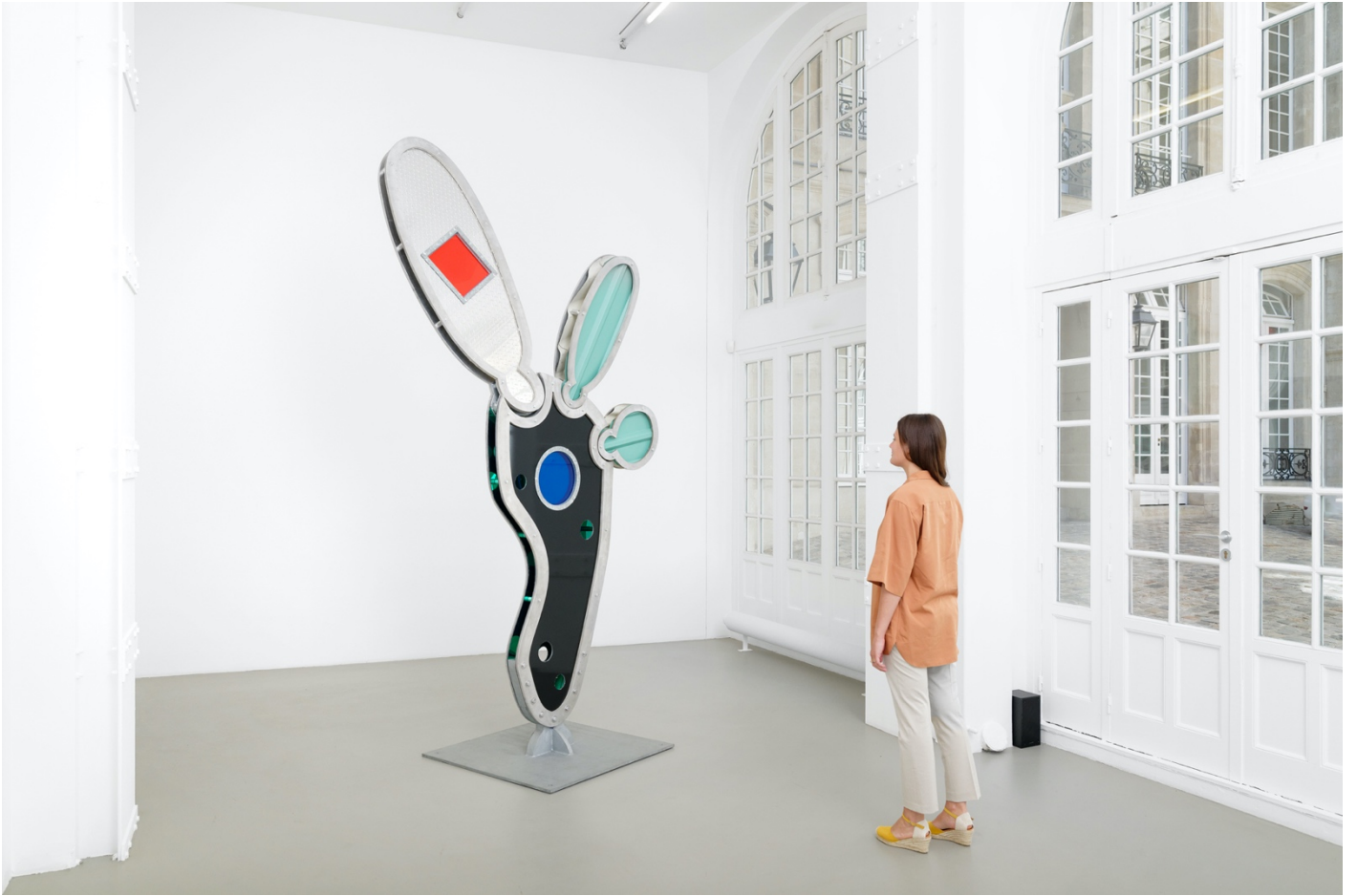
Vue de l'exposition Dennis Oppenheim, Galerie Mitterrand, Paris, 2020 / Exhibition view, Dennis Oppenheim, Galerie Mitterrand, Paris, 2020

79 RUE DU TEMPLE 75003 PARIS - T +33 1 43 26 12 05 F +33 1 46 33 44 83 INFO@GALERIEMITTERRAND.COM WWW.GALERIEMITTERRAND.COM