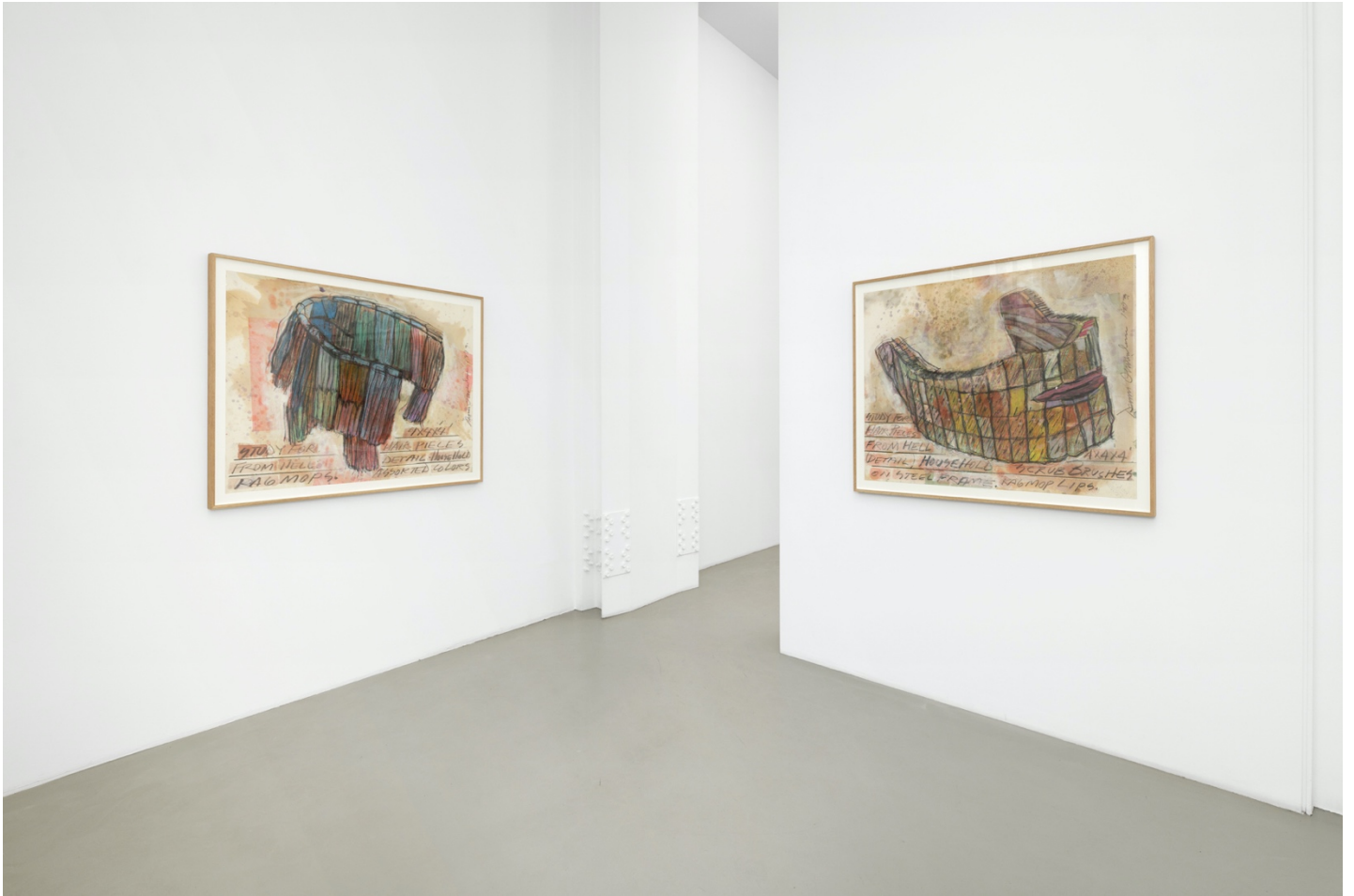
Vue de l'exposition Dennis Oppenheim, Galerie Mitterrand, Paris, 2020 / Exhibition view, Dennis Oppenheim, Galerie Mitterrand, Paris, 2020

79 RUE DU TEMPLE 75003 PARIS - T +33 1 43 26 12 05 F +33 1 46 33 44 83 INFO@GALERIEMITTERRAND.COM WWW.GALERIEMITTERRAND.COM