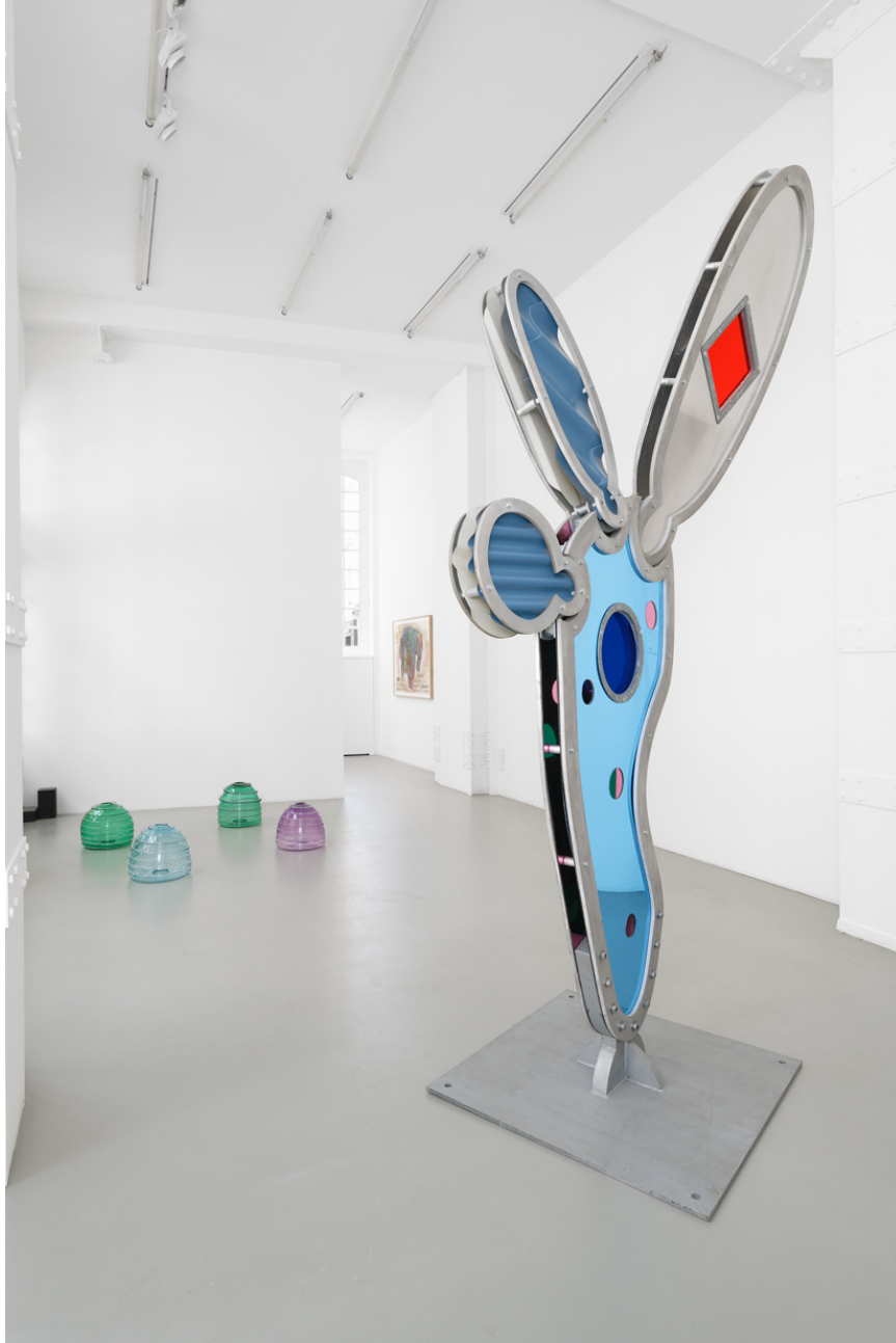
Vue de l'exposition Dennis Oppenheim, Galerie Mitterrand, Paris, 2020 / Exhibition view, Dennis Oppenheim, Galerie Mitterrand, Paris, 2020

79 RUE DU TEMPLE 75003 PARIS - T +33 1 43 26 12 05 F +33 1 46 33 44 83 INFO@GALERIEMITTERRAND.COM WWW.GALERIEMITTERRAND.COM