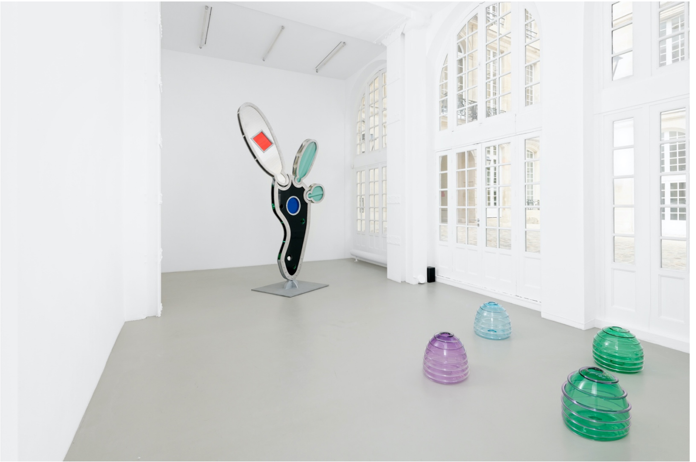
Vue de l'exposition Dennis Oppenheim, Galerie Mitterrand, Paris, 2020 / Exhibition view, Dennis Oppenheim, Galerie Mitterrand, Paris, 2020

79 RUE DU TEMPLE 75003 PARIS - T +33 1 43 26 12 05 F +33 1 46 33 44 83 INFO@GALERIEMITTERRAND.COM WWW.GALERIEMITTERRAND.COM