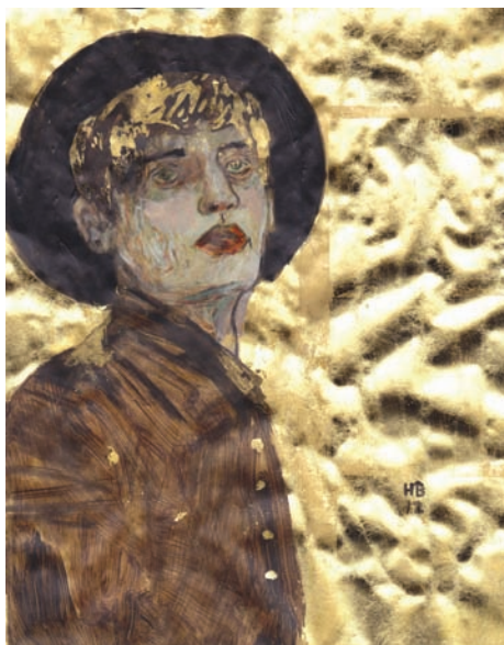
"Unknown poet #10 (The desert stirred him)", 2012 Acrylic, 24K gold leaf and graphite on gold dusted paper 33 x 28 cm / 13 x 11 inches