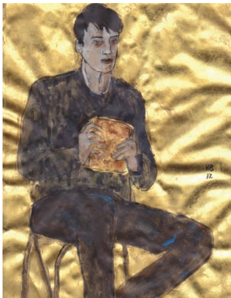
"Unknown poet # 9 (The bible was his bible)", 2012 Acrylic, 24K gold leaf and graphite on gold dusted paper 33 x 28 cm / 13 x 11 inches