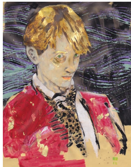
"Unknown poet # 13 (He was obsessed with color)", 2012 Acrylic, 24K gold leaf and graphite on gold dusted paper 33 x 28 cm / 13 x 11 inches