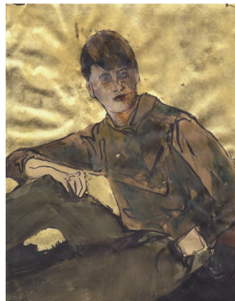
"Unknown poet #3 (His life was a privileged loss)", 2012 Acrylic, 24K gold leaf and graphite on gold dusted paper 33 x 28 cm / 13 x 11 inches

Born in 1978, Miami, Florida, Hernan Bas lives and works in Detroit, USA.