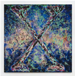
Vaughn Spann - Cosmic Symbiote (Marked Man) , 2019 - Polymer paint, mixed media on aluminum stretcher bars - 84 x 84 1/8 inches; 213.4 x 213.7 cm / © Vaughn Spann - Courtesy of the Artist and Almine Rech - Photo: Dan Bradica

Opening Reception Wednesday, January 15th 6 to 8 PM