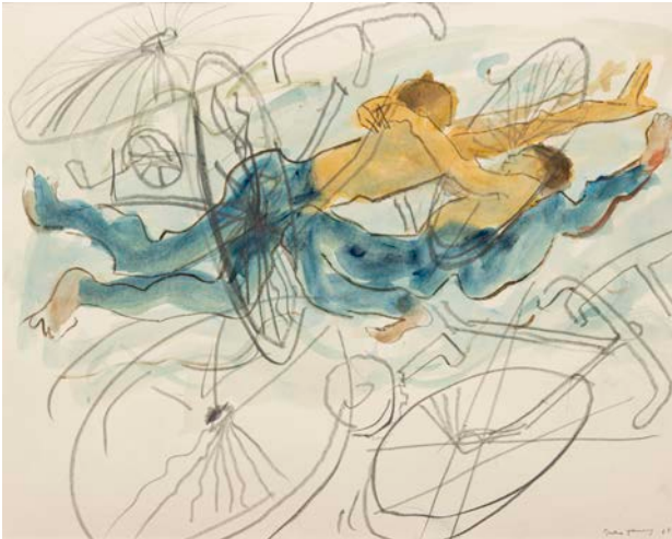
Dorothea Tanning, Worlds in Collision, 1988.

DOROTHEA TANNING: WORLDS IN COLLISION 24 JANUARY - 21 MARCH 2020 PRIVATE VIEW: THURSDAY 23 JANUARY, 6PM - 8PM