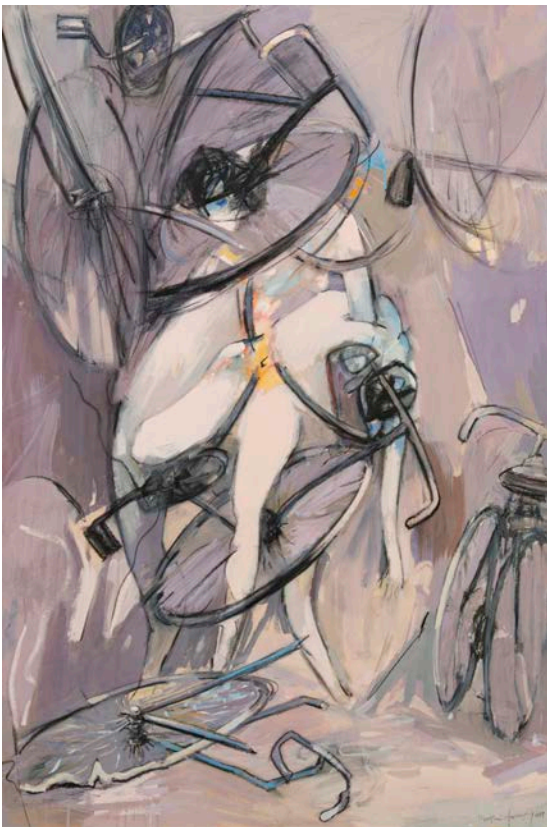
Dorothea Tanning, Between Lives , 1989 © Artists Rights Society, New York, and ADAGP, Paris

FORTHCOMING EXHIBITION: GORDON PARKS , 27 MARCH - 30 MAY 2020