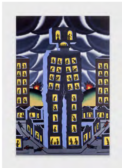
Sarajevo the Serbian Way, 1993