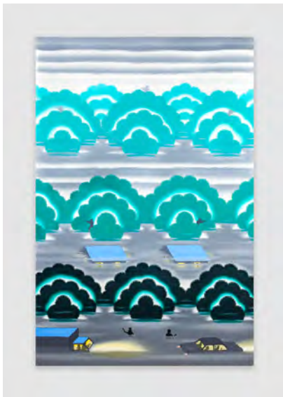
Travelers in a Mist, 1976