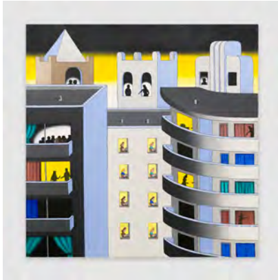
Old and New Eight Ladies Typing, 1972