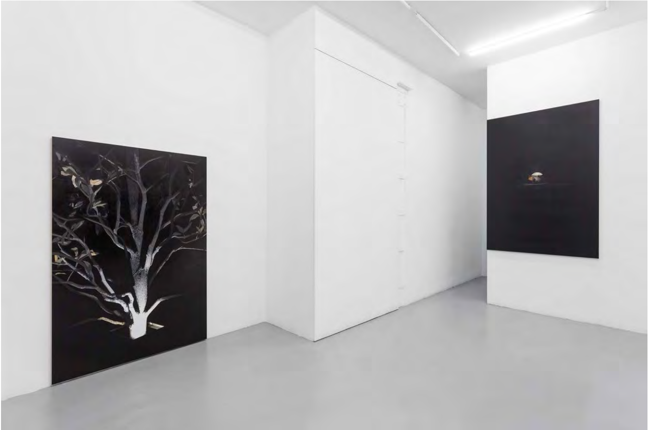
Gonçalo Preto Middle Finger Pedestrians installation view 16th November 2019 — 11th January 2020