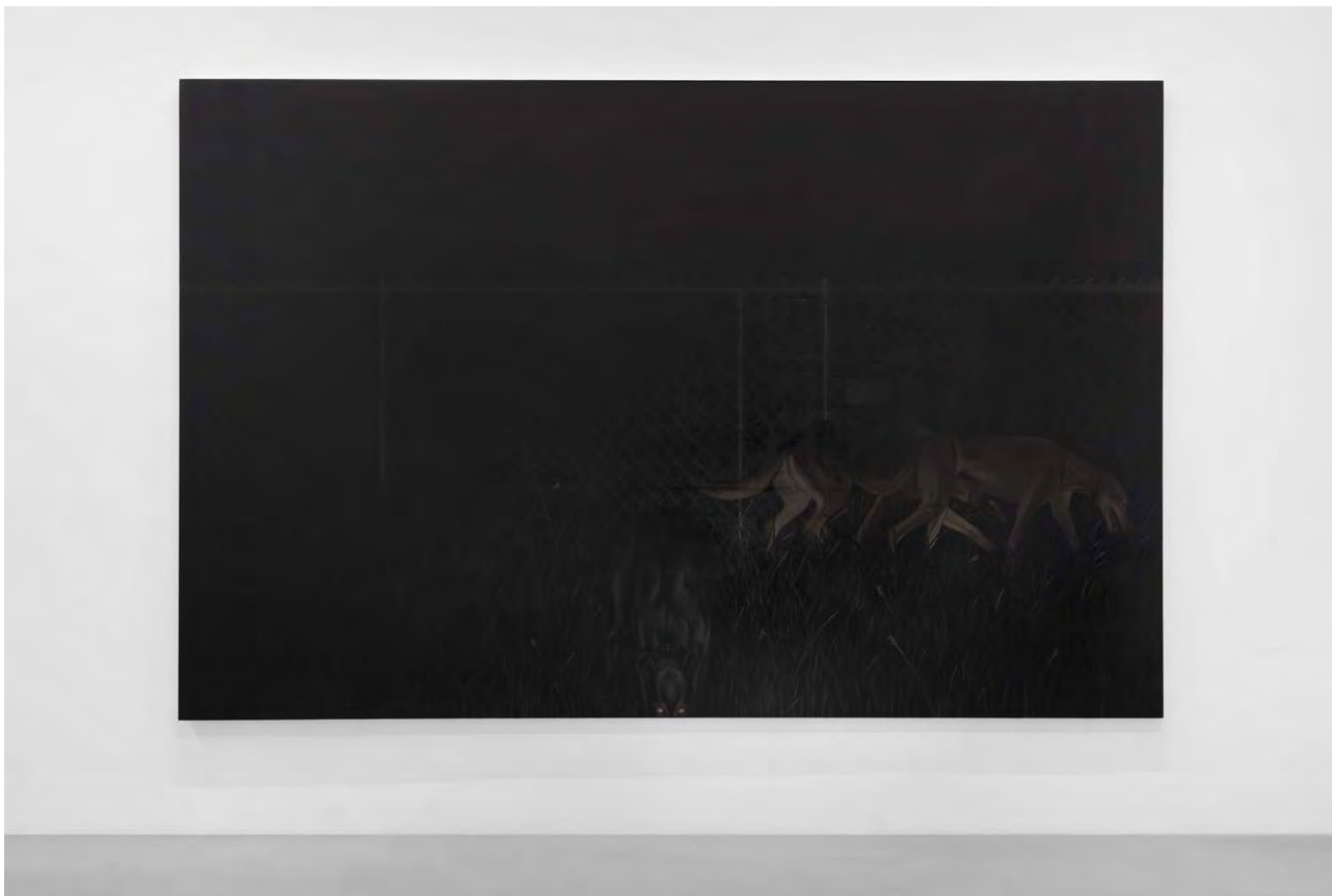
Gonçalo Preto spine-tingling 2019 oil on canvas 160 x 250 cm unique