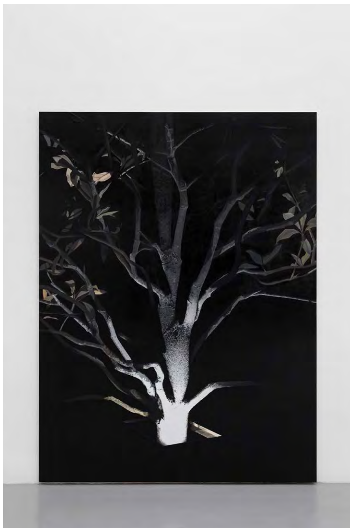
Gonçalo Preto LUNAR 2019 oil on wood 160 x 120 cm unique