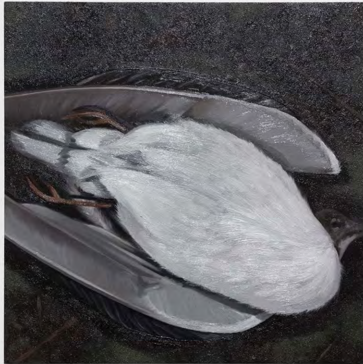
Gonçalo Preto Artéria 2019 oil on wood 30 x 30 cm unique