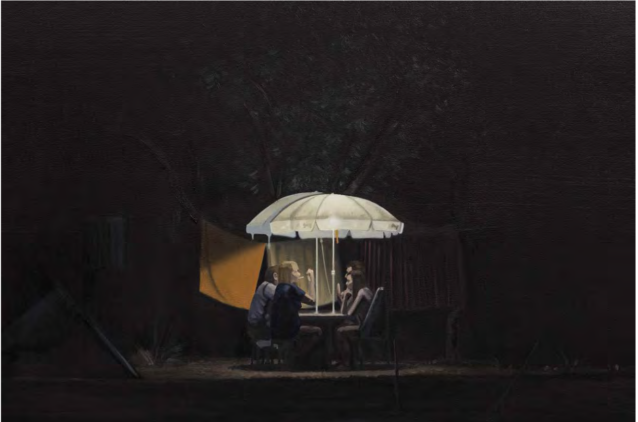
Gonçalo Preto Misfits (detail) 2019 oil on wood 160 x 120 cm unique