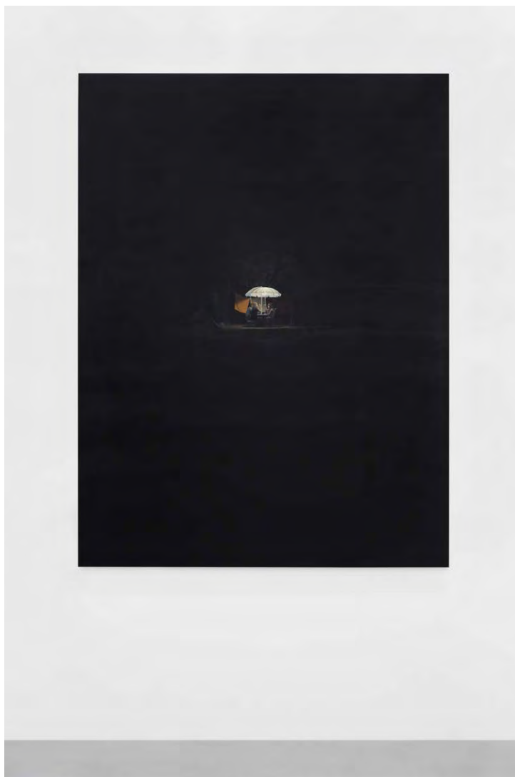
Gonçalo Preto Misfits 2019 oil on wood 160 x 120 cm unique