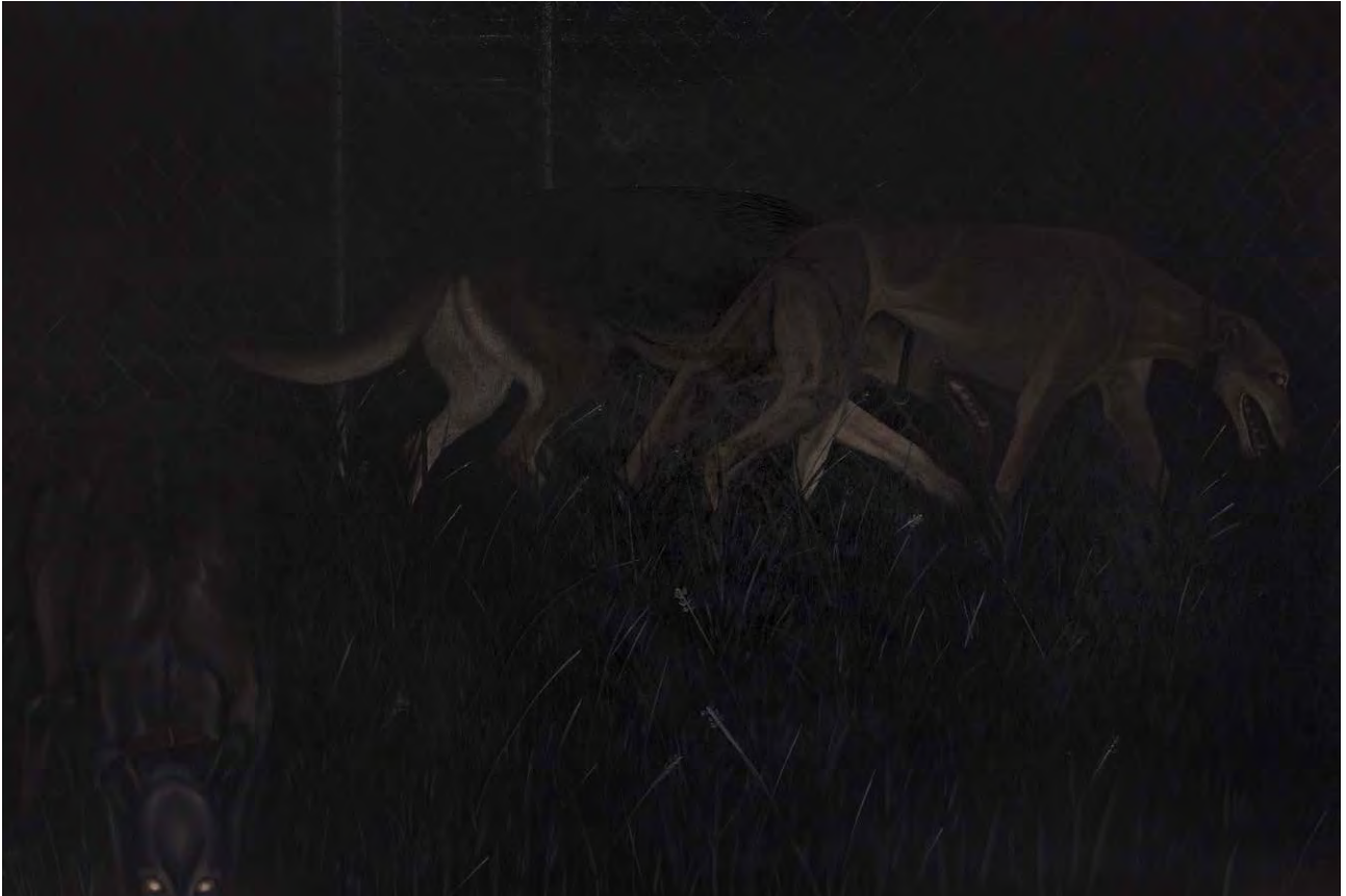
Gonçalo Preto spine-tingling (detail) 2019 oil on canvas 160 x 250 cm unique