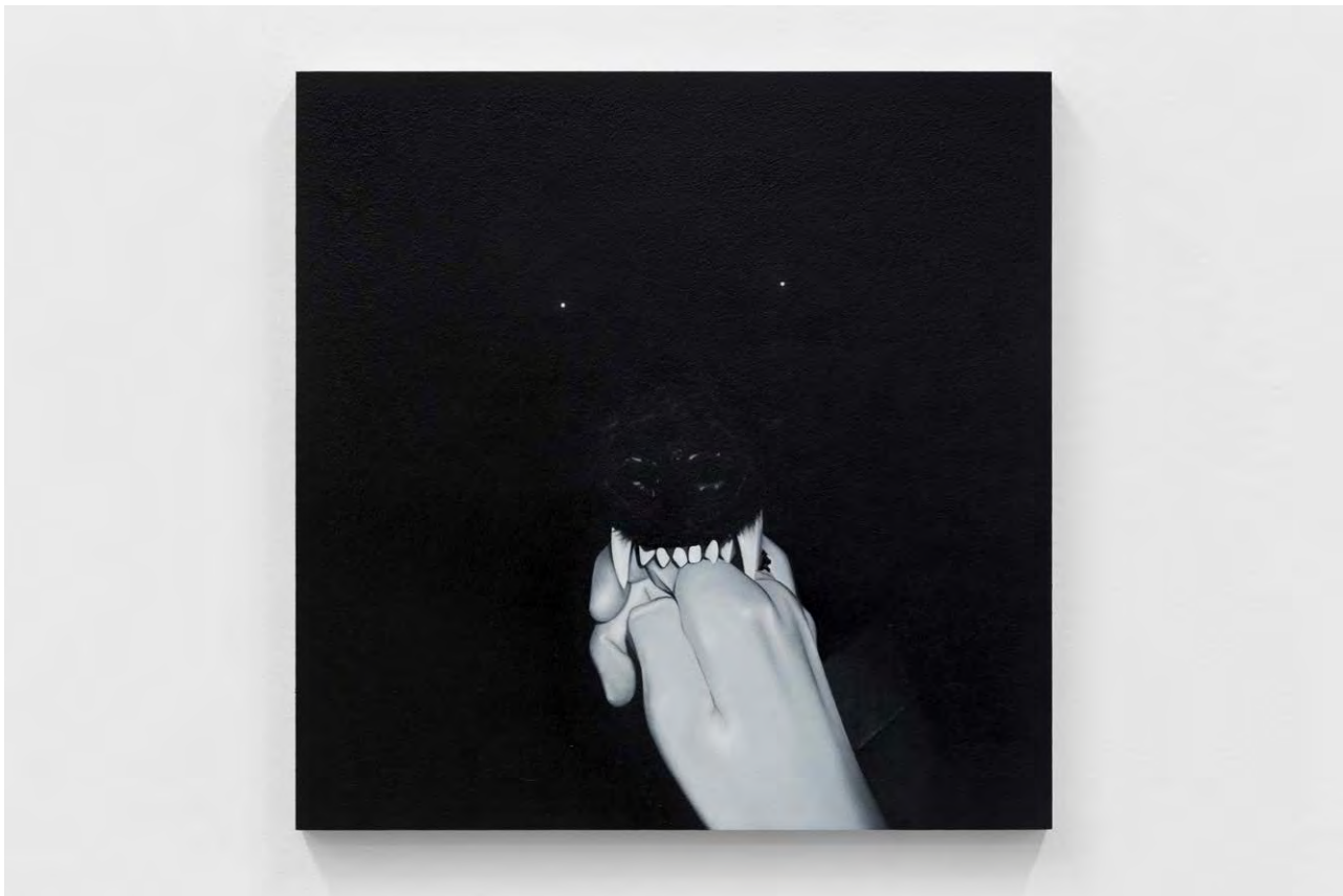
Gonçalo Preto Morcego ou Macaco? 2019 oil on wood 30 x 30cm unique