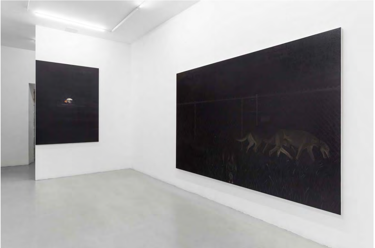
Gonçalo Preto Middle Finger Pedestrians installation view 16th November 2019 — 11th January 2020