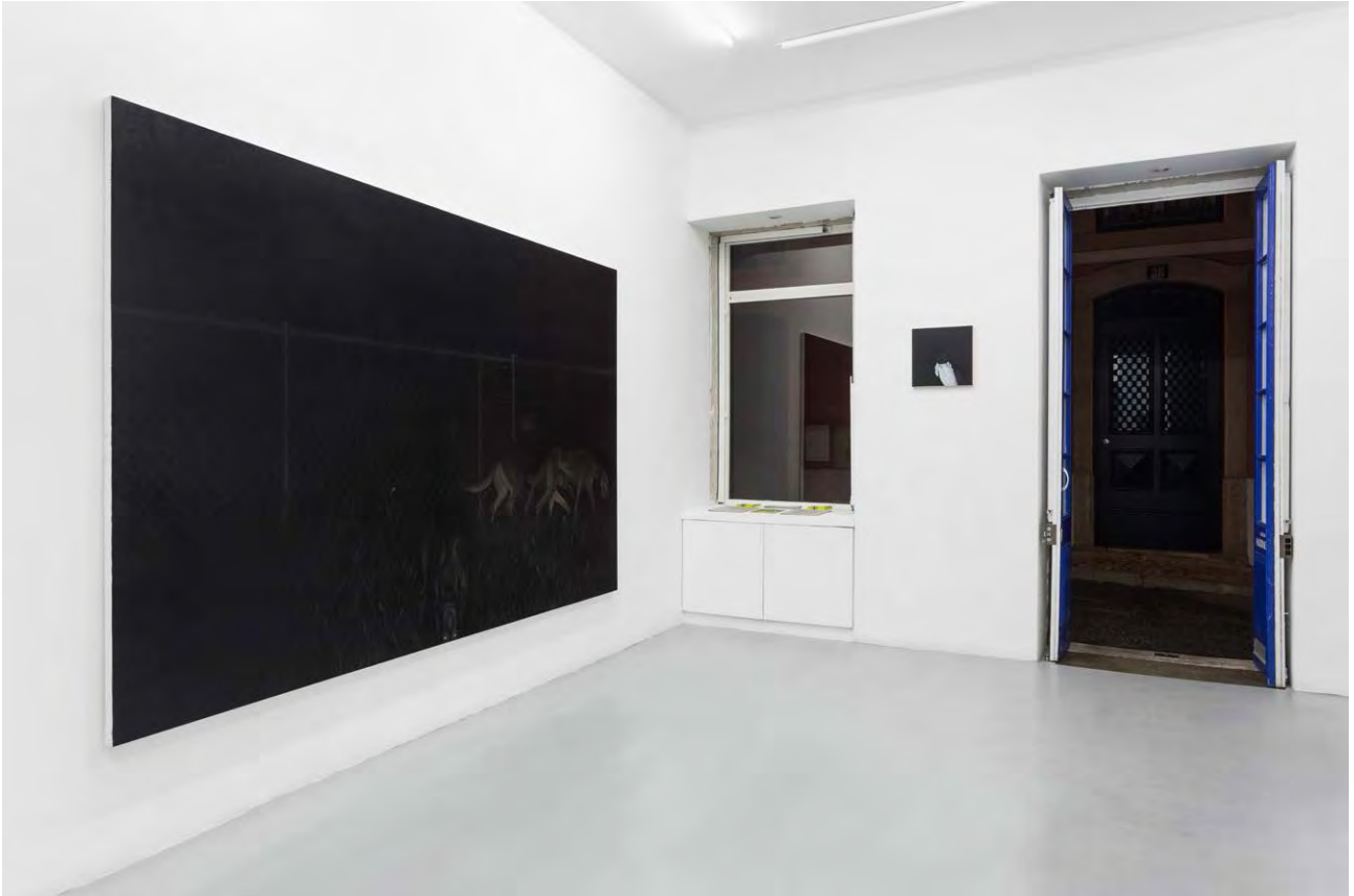
Gonçalo Preto Middle Finger Pedestrians installation view 16th November 2019 — 11th January 2020