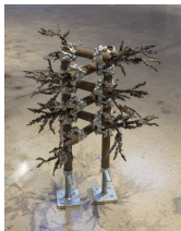
Luciana Lamothe Burnt , 2019 Iron pipes and clamps 42 x 28 x 28 inches (106.7 x 71.1 x 71.1 cm)