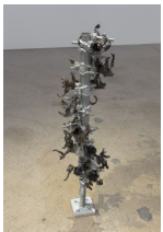
Luciana Lamothe Burning Inside , 2019 Iron pipes and clamps 45 x 12 x 12 inches (114.3 x 30.5 x 30.5 cm)