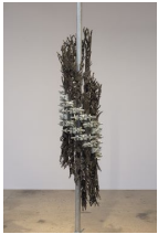
Luciana Lamothe Burning Forever , 2019 Iron pipes and clamps 81 x 19 x 16 inches (205.7 x 48.3 x 40.6 cm)