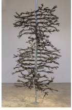
Luciana Lamothe Burning in Air , 2019 Iron pipes and clamps 128 x 60 x 60 inches (325.1 x 152.4 x 152.4 cm)