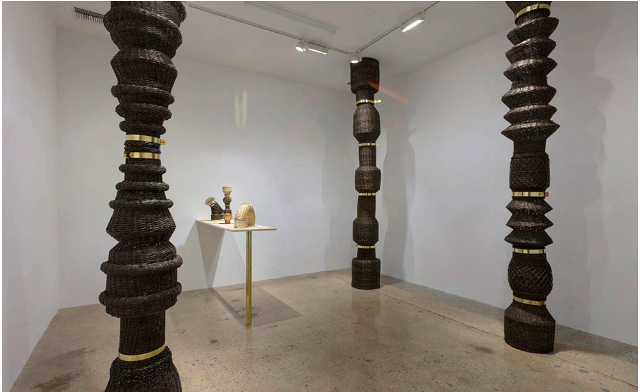
Eugenia Mendoza: Criollo Fittings November 23 - December 21, 2019

Steve Turner is pleased to present Criollo Fittings , a solo exhibition by Buenos Aires-based Eugenia Mendoza that will present woven wicker sculptures of mass-produced pipe fittings and other elements from building construction. She uses the materials and methods once common to the Paraná River delta area near Buenos Aires to depict ordinary construction elements that are common in Argentina's ever-expanding capital city.