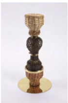
Eugenia Mendoza Reducing , 2019 Bronze and wicker 19 5 / 8 x 5 7 / 8 inches (50 x 15 cm)