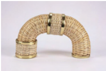
Eugenia Mendoza Bend , 2019 Bronze and wicker 13 x 19 5 / 8 x 5 7 / 8 inches (33 x 50 x 15 cm)