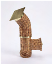
Eugenia Mendoza Equal Tee & Elbow , 2019 Bronze and wicker 19 5 / 8 x 9 1 / 2 x 7 7 / 8 inches (50 x 24 x 20 cm)