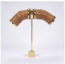
Eugenia Mendoza Elbows , 2019 Bronze and wicker 23 5 / 8 x 20 1 / 2 x 5 1 / 8 inches (60 x 52 x 13 cm)