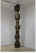
Eugenia Mendoza Bellow, No. 1 , 2019 Bronze and wicker 146 x 19 x 19 inches (370.8 x 48.3 x 48.3 cm)